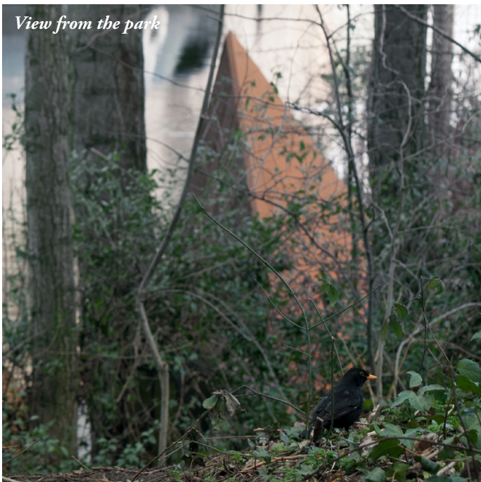
View from the park