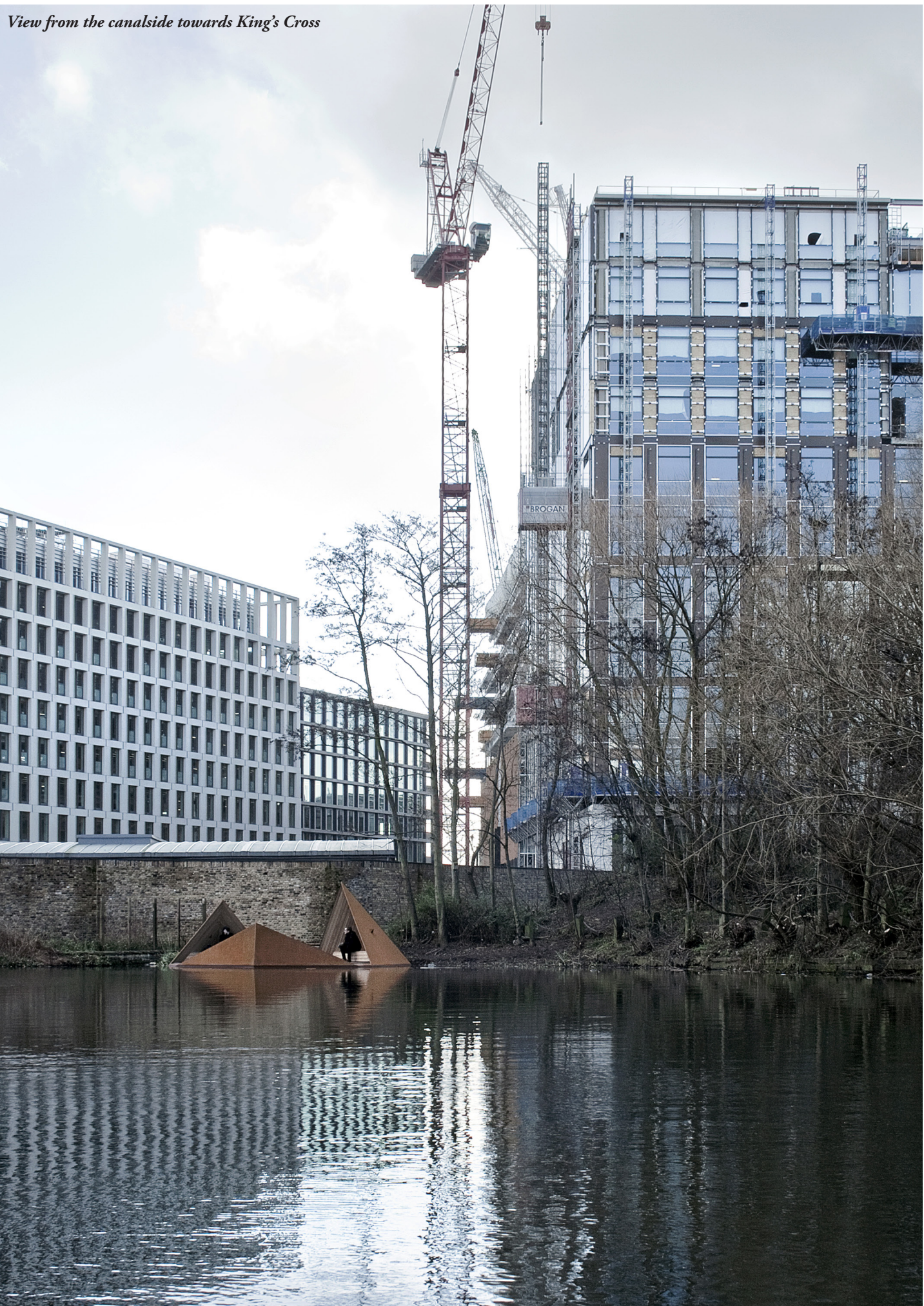
View from the canalside towards King's Cross