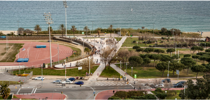
The Mar Bella (MB)