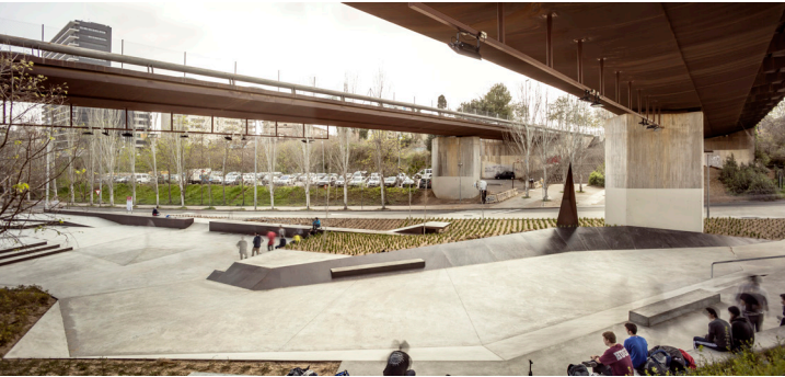
Les Corts (LC)

The Nou Barris Urban Sports Park , is located on a covered section of the Ronda de Dalt. This project consists of the refurbishment of an old skate park which was only partially exploited. Over a long process of public consultation which involved working extensively with local users, a design that would best address their needs was achieved. The skatepark incorporates elements that are interconnected with one another and the surroundings, establishing a spatial continuity with the park where it's accommodated, and thus facilitating relationships between users of both the skatepark and the park.