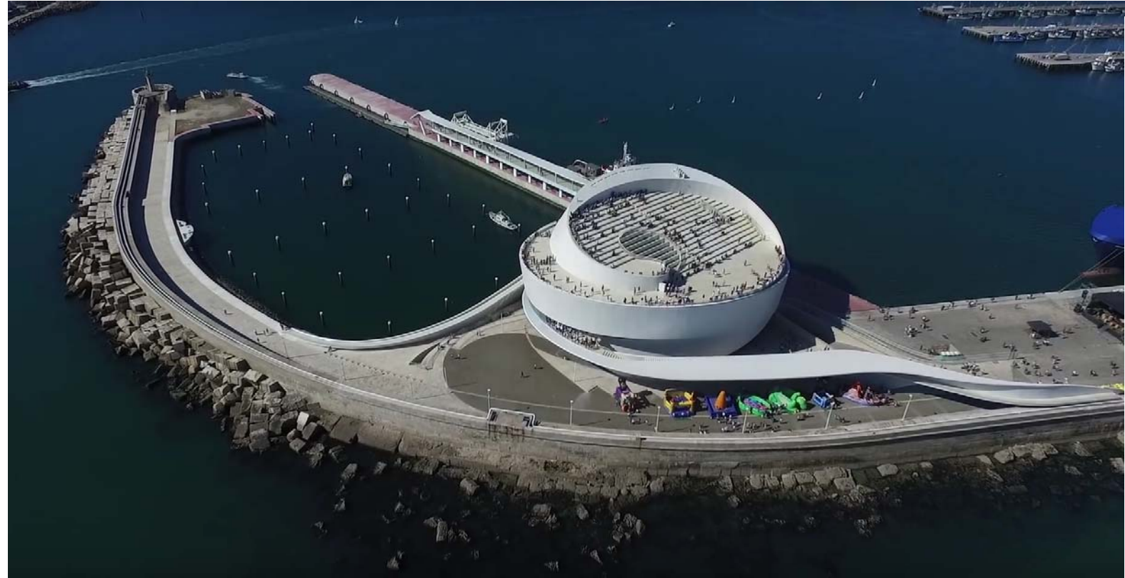
AERIAL VIEW OF THE INTERVENTION

Designed simultaneously for the landscape and for the body, strictly thought to get the complex mixture of its functions flowing, Porto Cruise Terminal is now a reference of the city's and Northern Portugal's public space.