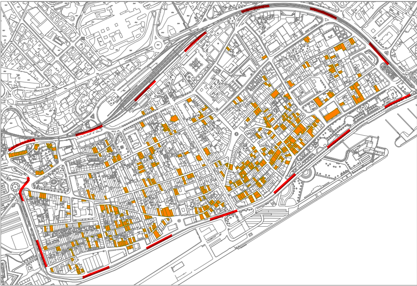
buildings in need of repair in the historical centre in 2000 prior to detail plan