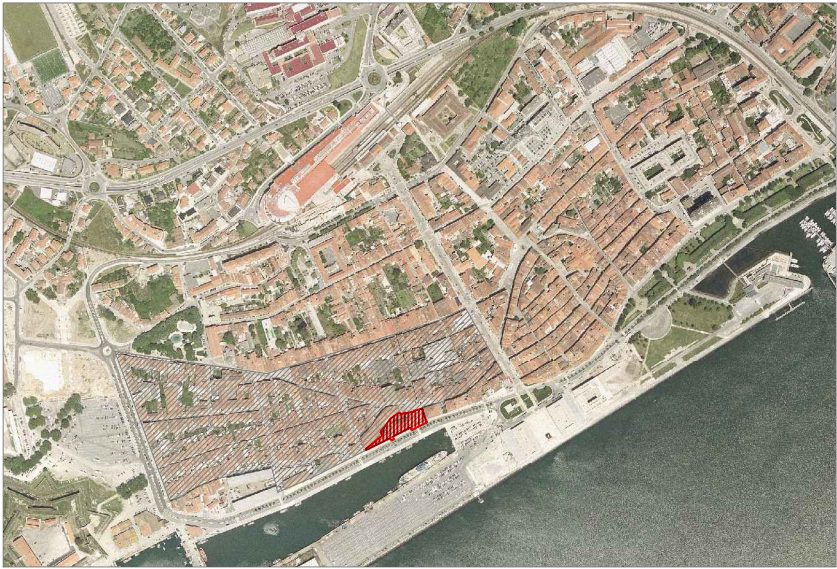
the largo vasco da gama sector (in red)in the broader project area

The images above show the prevalent use as a car park of the project area prior to the intervention. Also in evidence is the preexisting state of disrepair of pavements and sidewalks. Prior to intervention there was also a widespread need of repair of the area buidings (left plan at the top) At far right top, the detail plan proposal for the historical center. In yellow, the new buidings proposed for the western riverfront sector, seek to requalify a riverfront left bereft of use due to transfer of the main port area to the left bank of the river. The plan at left shows a broad range of materials particularly in the sidewalks as well the diminute size of these compared with the space assigned to car use.