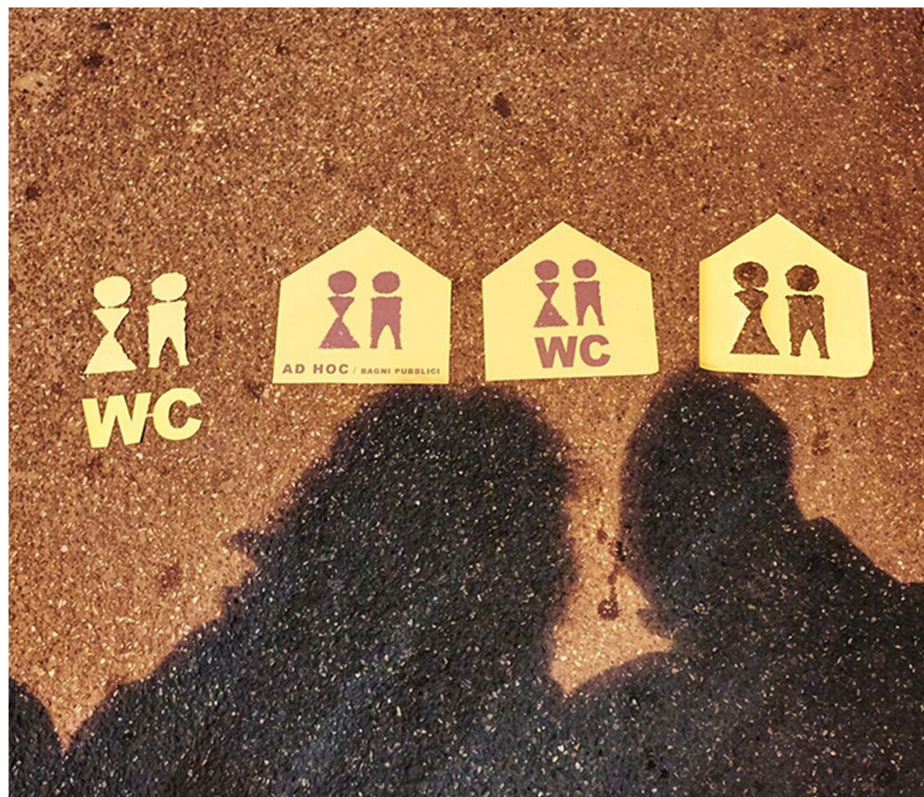
> ROAD SIGN TESTS