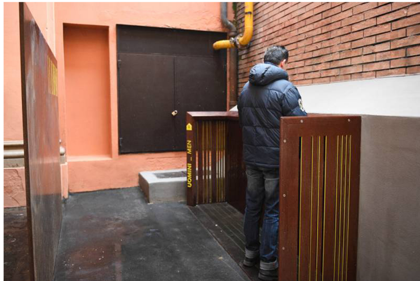
> PUBLIC URINAL FOR MEN : a sheet of steel Cor-ten with a water blade and a grid collect

REALIZATION > URINE IS NOT IN THE STREETS ANYMORE / THE MOST SIMPLE AND EFFECTIVE SOLUTION