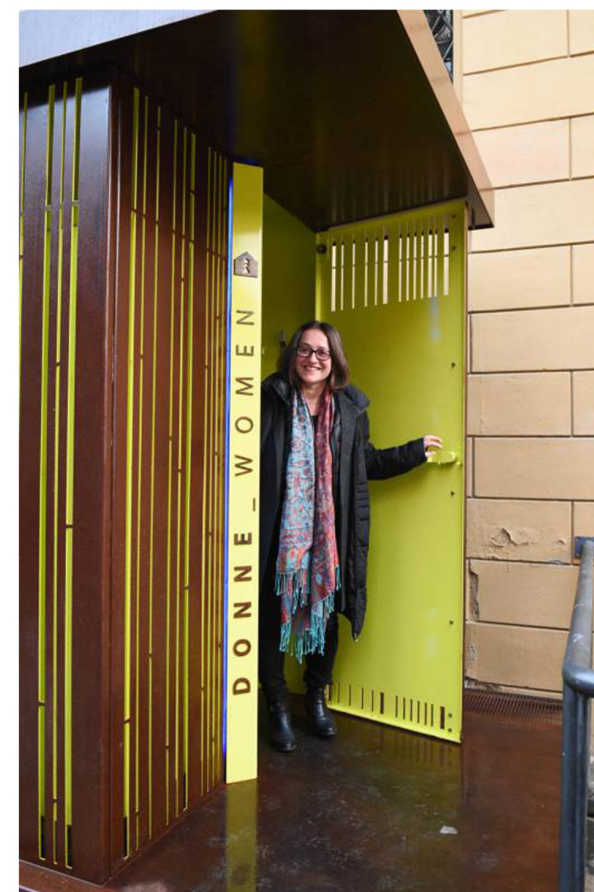
> PUBLIC URINAL FOR WOMEN : it is very used