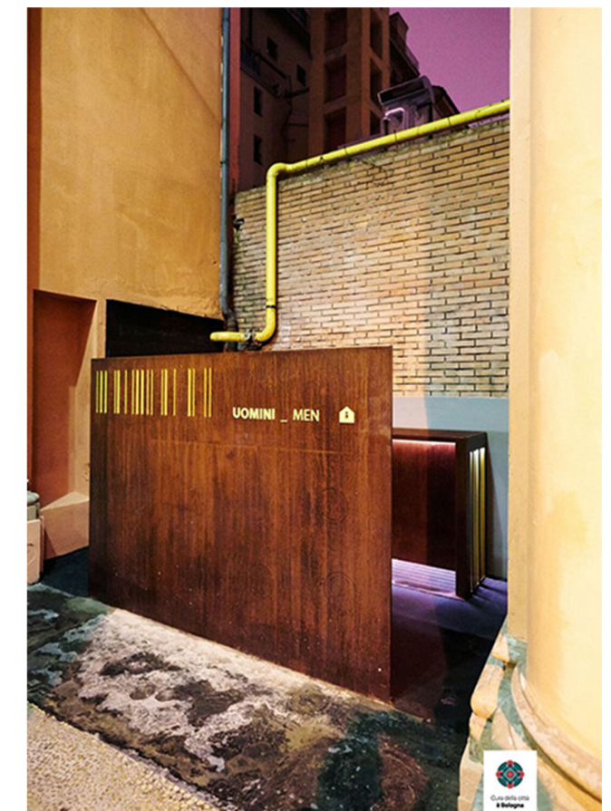
> PUBLIC URINAL FOR MEN : shielding