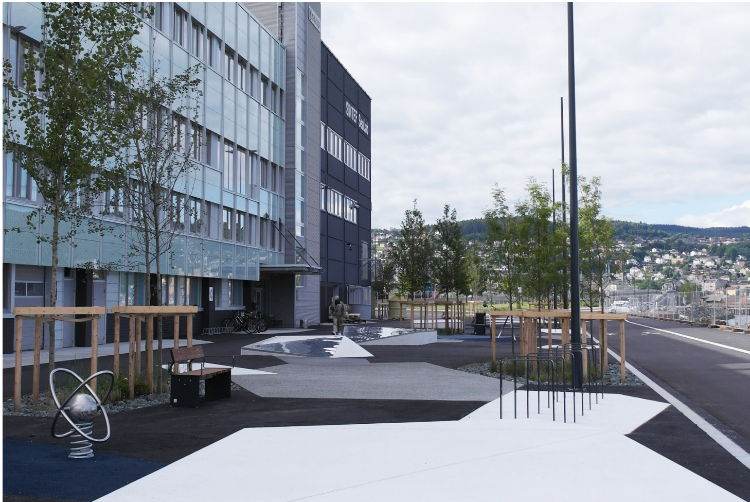
The site after the intervention