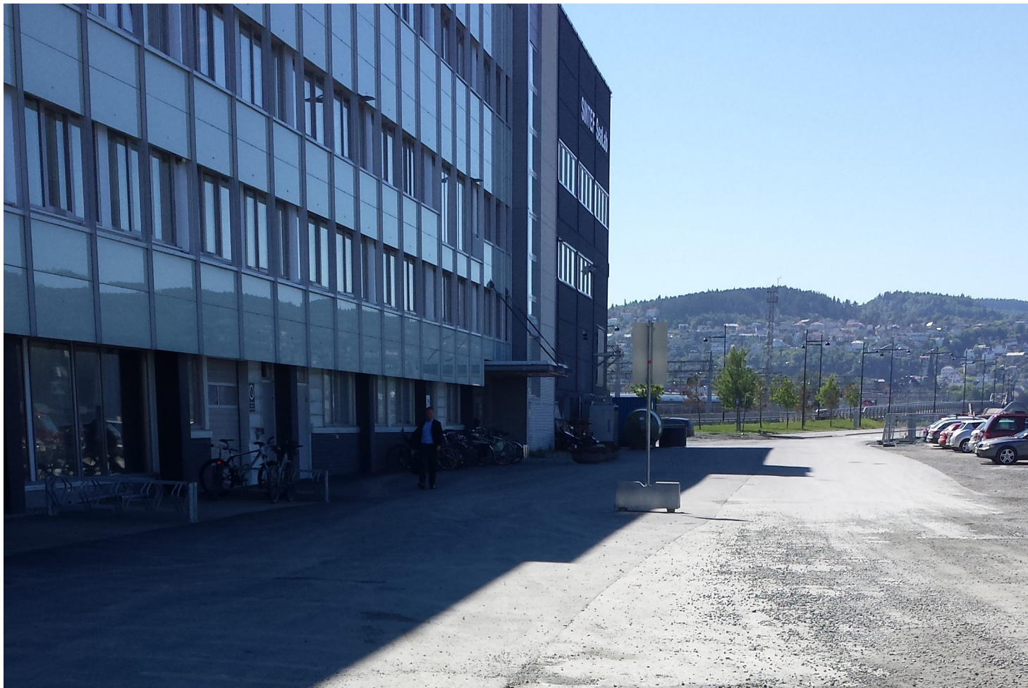
The site before the intervention