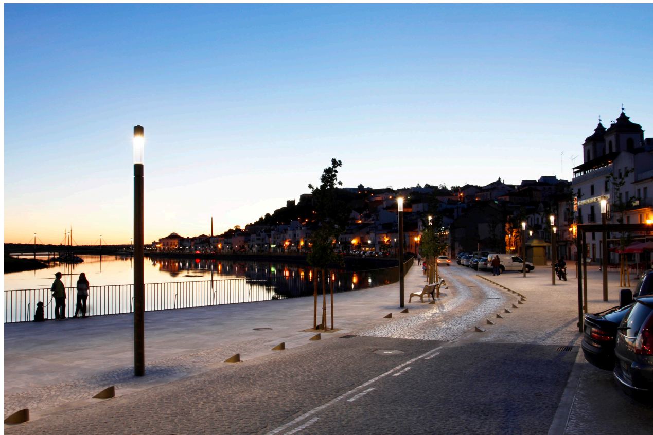
View to West side (Luis de Camões Square)