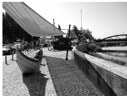
Before the intervention