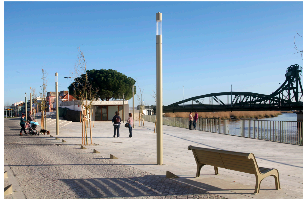
View to East side (Tourism Office)