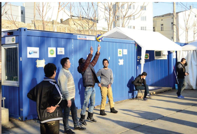
Refugee Aid Camp