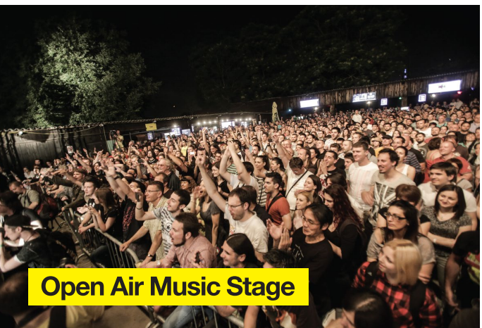
Open Air Music Stage