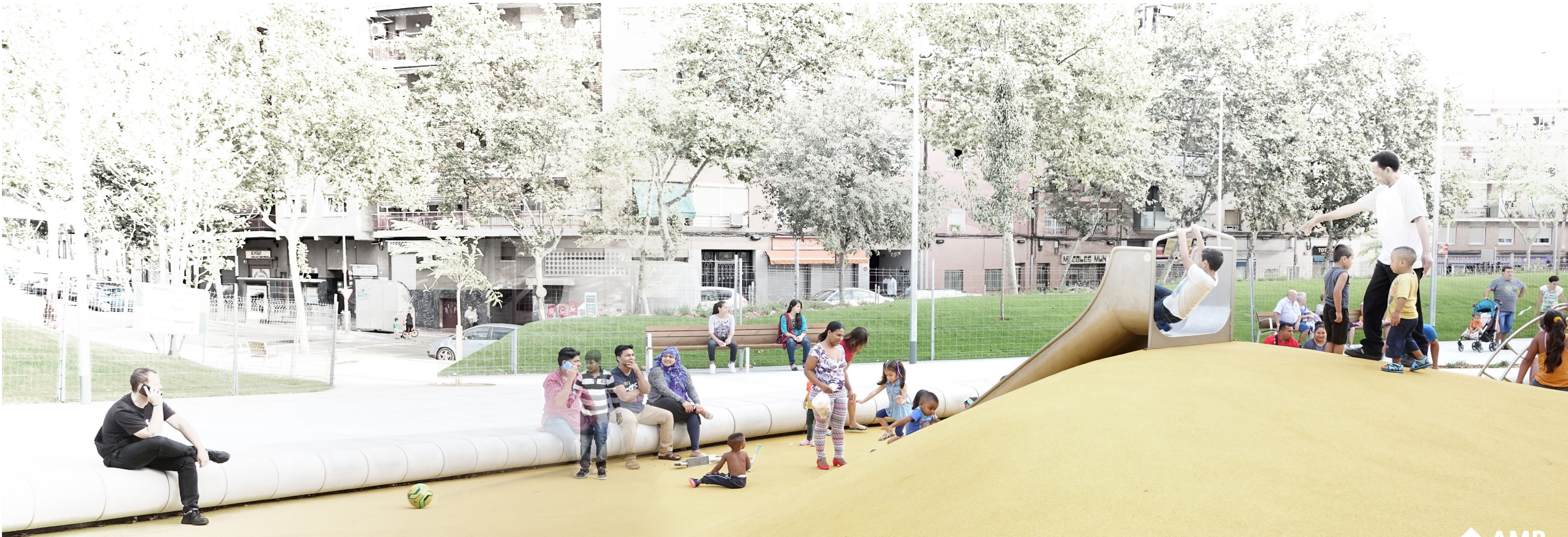
The rubber dune turns the topography into a game