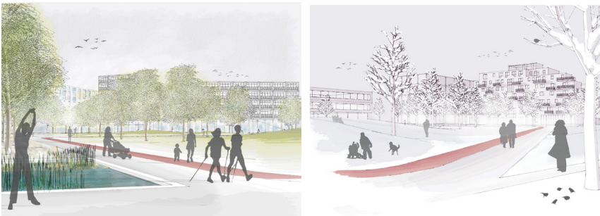
Various images of the course of the day showing the seasons, sports and recreation