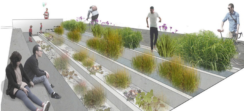
The drainage is above ground and enters into the cascading rainwater garden