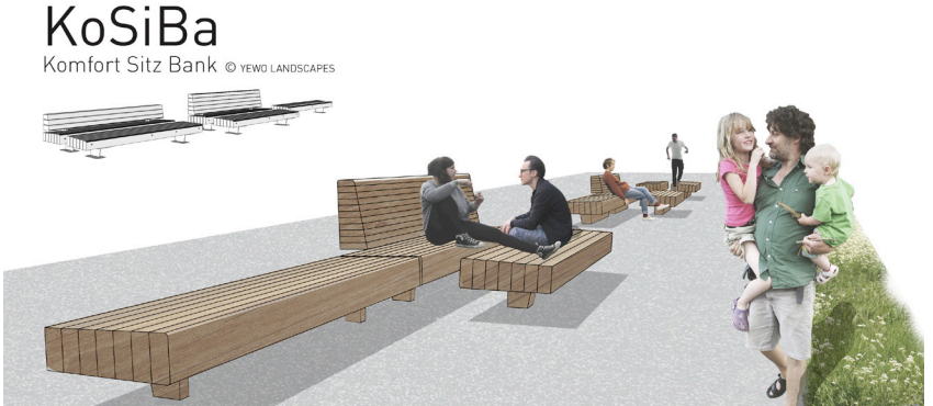
The Communication Bench KoSiBa is a modular seating furniture by YEWo LANDSCAPES