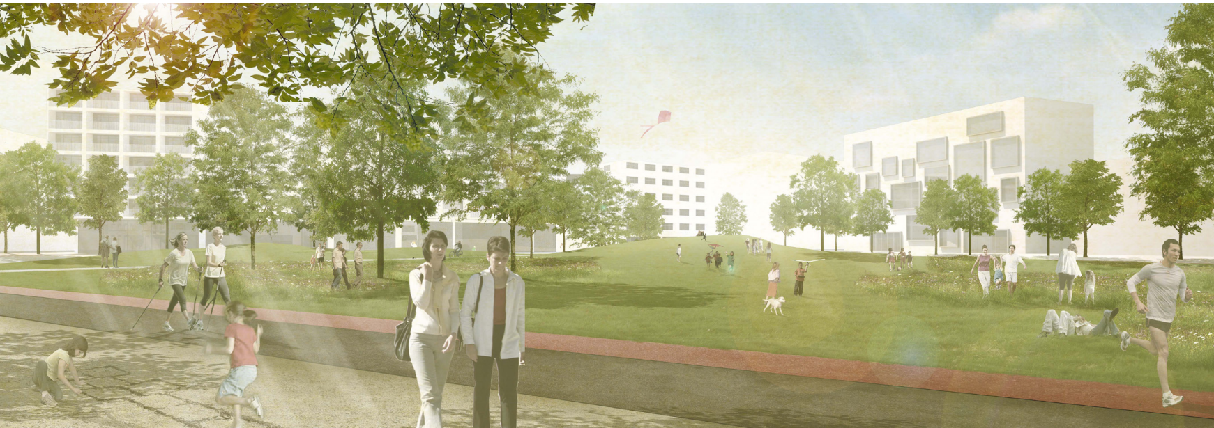
View into the green center of the park