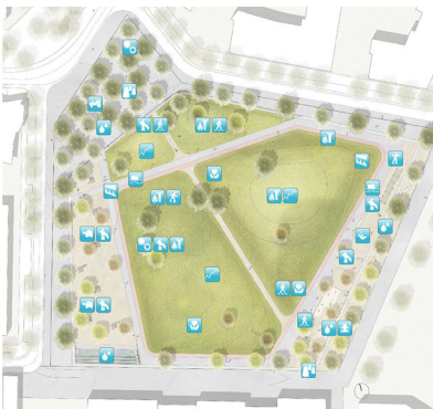
Survey of requirements