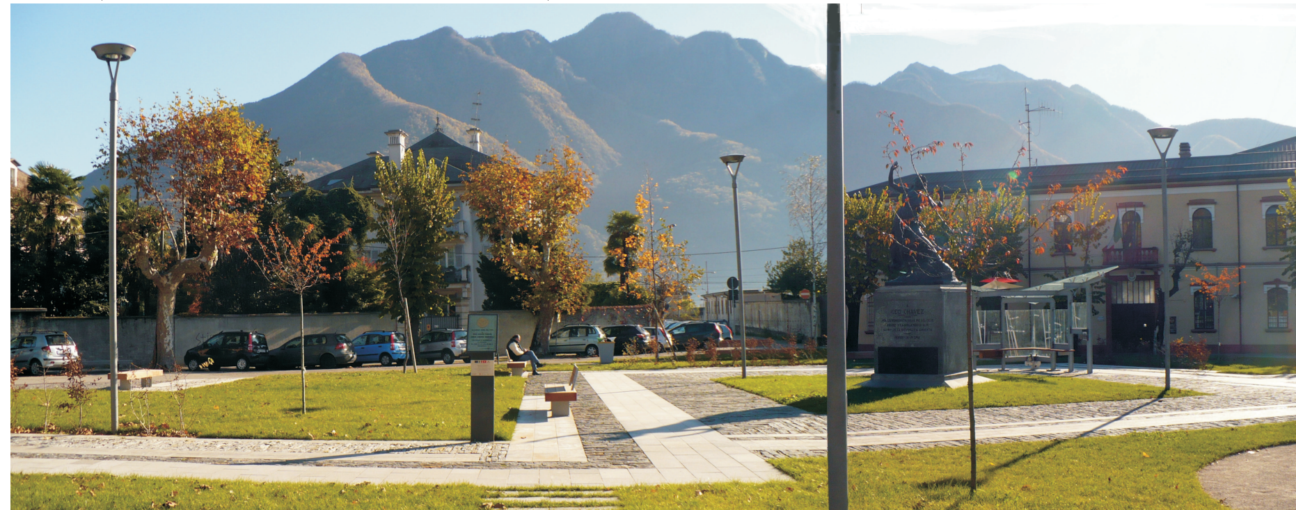
western view