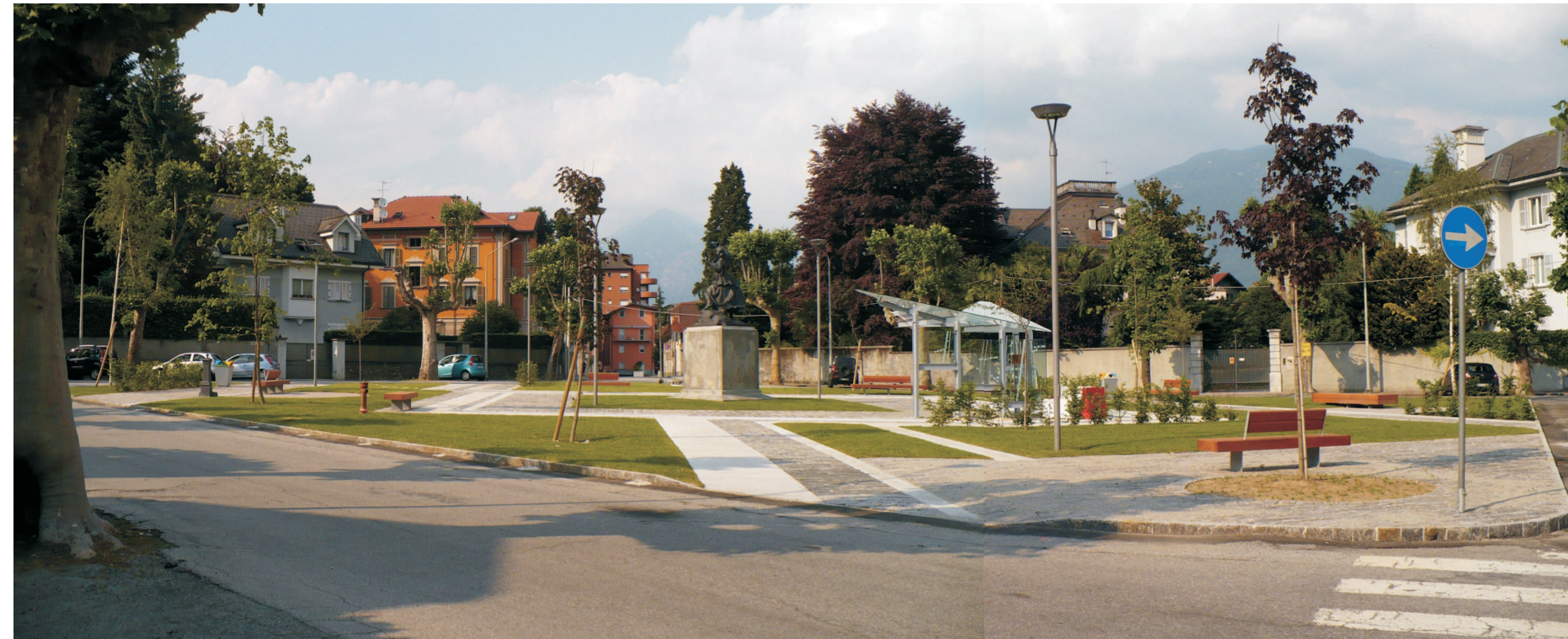
S - W view (above: after intervention, bottom: before intervention)