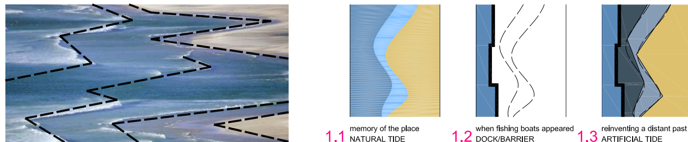
1.1 memory of the place NATURAL TIDE 1.2 when fishing boats appeared DOCK/BARRIER 1.3 reinventing a distant past ARTIFICIAL TIDE