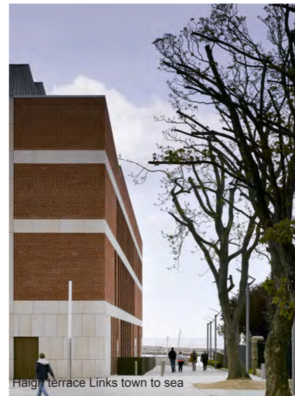
Haigh terrace Links town to sea