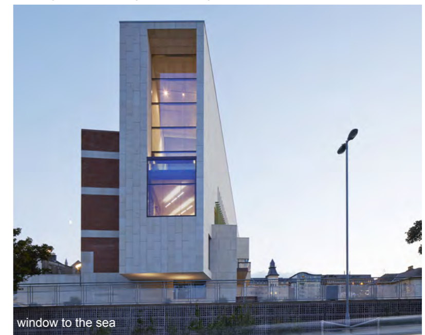
window to the sea