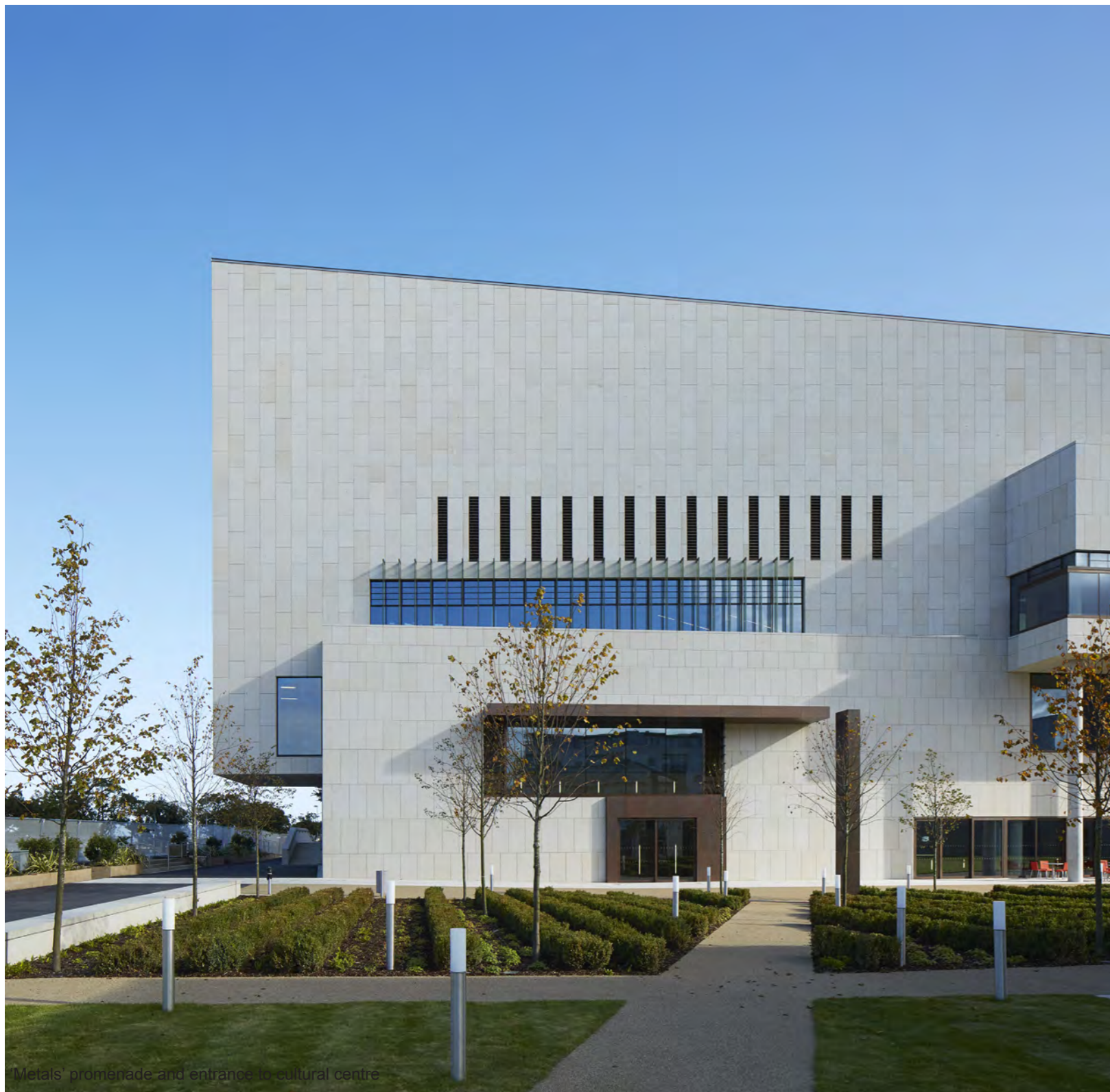
Metals' promenade and entrance to cultural centre