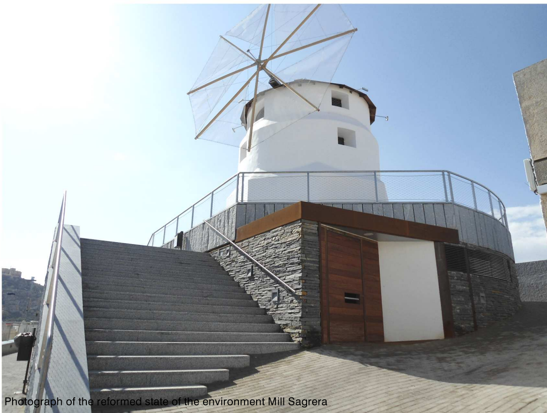
Photograph of the reformed state of the environment Mill Sagrera

To improve the conditions for use of the public square , a local service associated with it in the same grade as support for the improvement of the activity in the same projects . This space will provide direct access to useful information for the visitor : Possibilities of accommodation, food and catering, cultural, sporting , recreational, entertainment etc. , as well as procedures to enjoy them ( contacts with companies, reserves and other actions) .