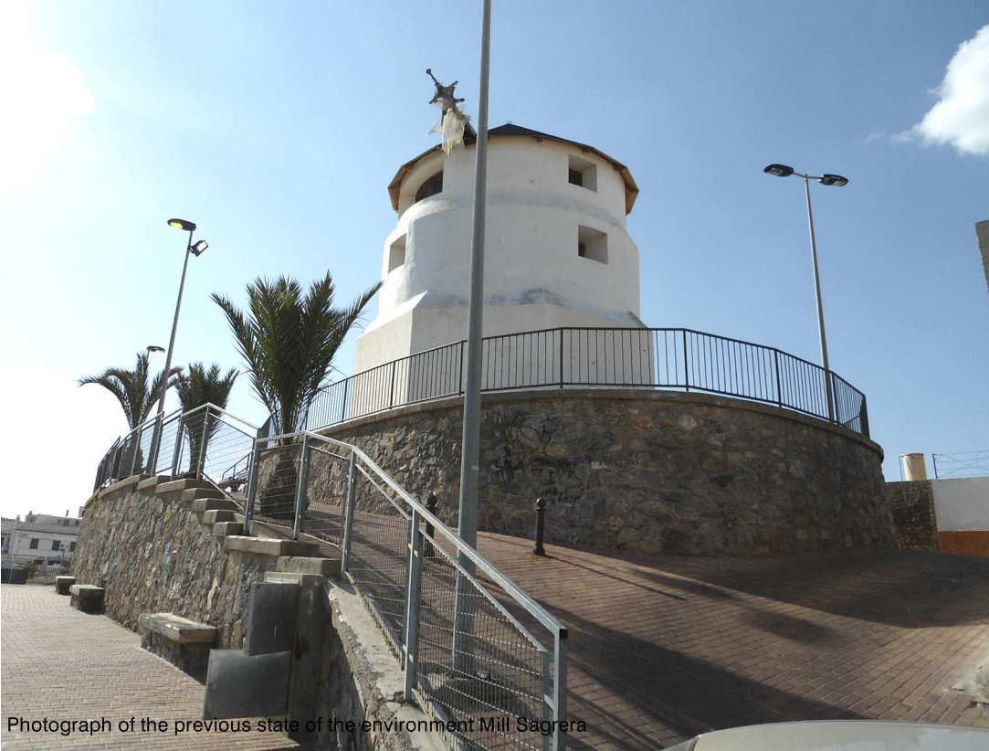
Photograph of the previous state of the environment Mill Sagrera