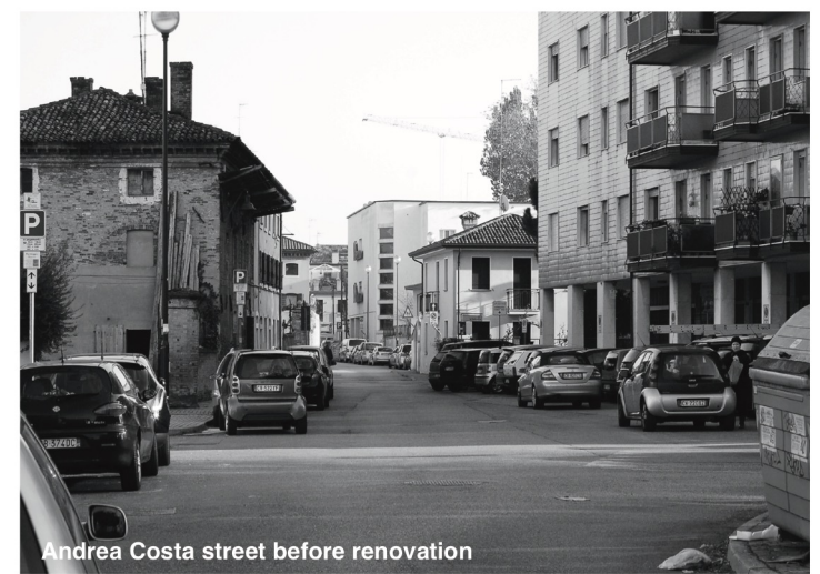
Andrea Costa street before renovation