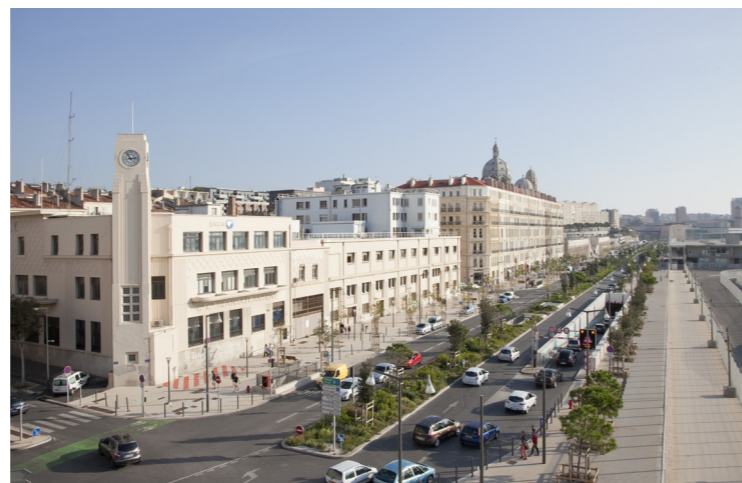
Boulevard of the coast.