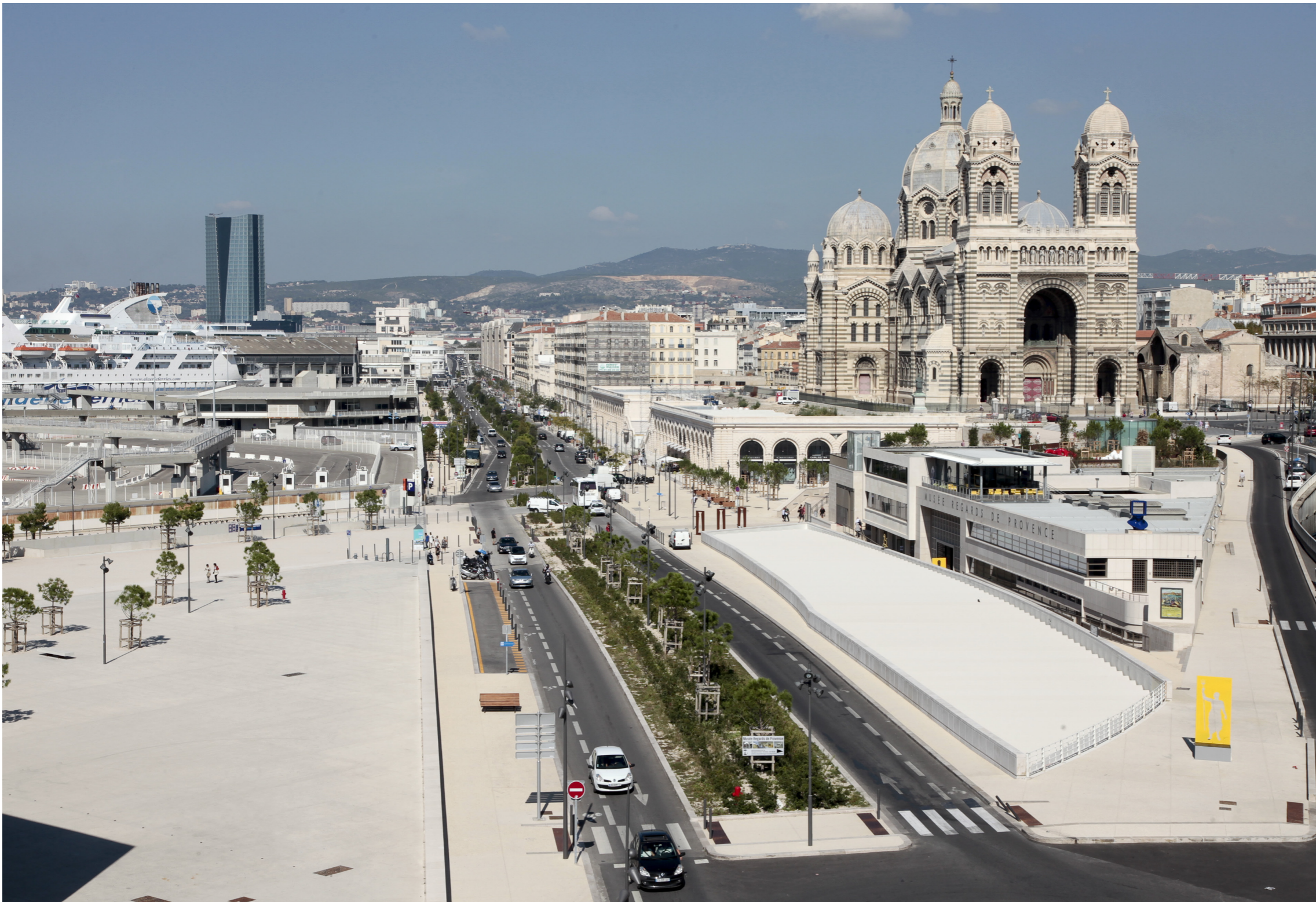
The boulevard of the coast which connects the Port and the quays with the city.

With the renovation of Boulevard du Littoral, Place de la Méditerranée, the J4 esplanade, the inner harbour, the Jardin Vaudoier and Place Albert Londres, the work is currently valued at M€ 58 + VAT.