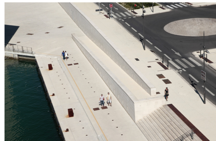
Detail of the docks