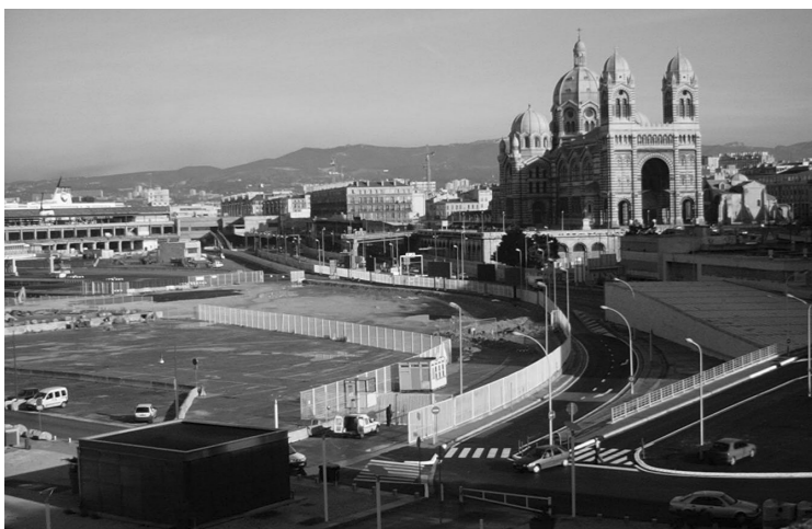
The existing project.