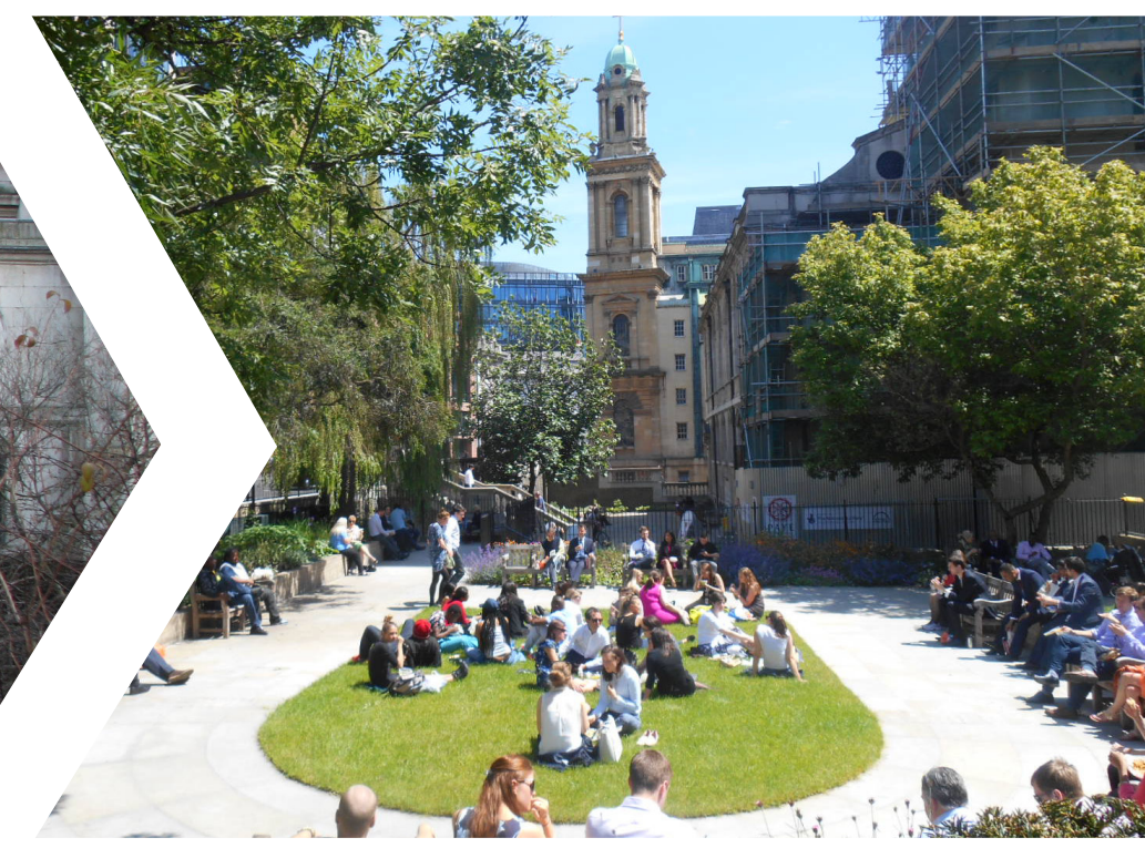
After works: Local residents and workers enjoying the new enhanced public gardens, in an area where public space is at a premium.