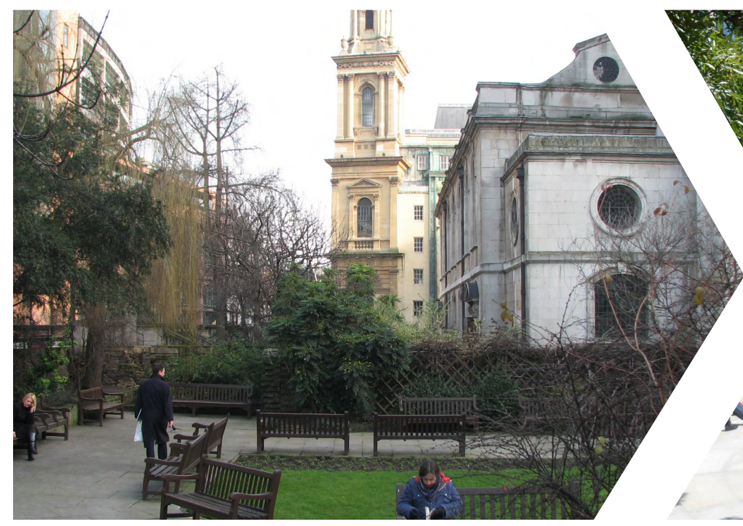
St Andrew Holborn Church Garden before works: an unattractive public space not well used by workers and visitors of the area.