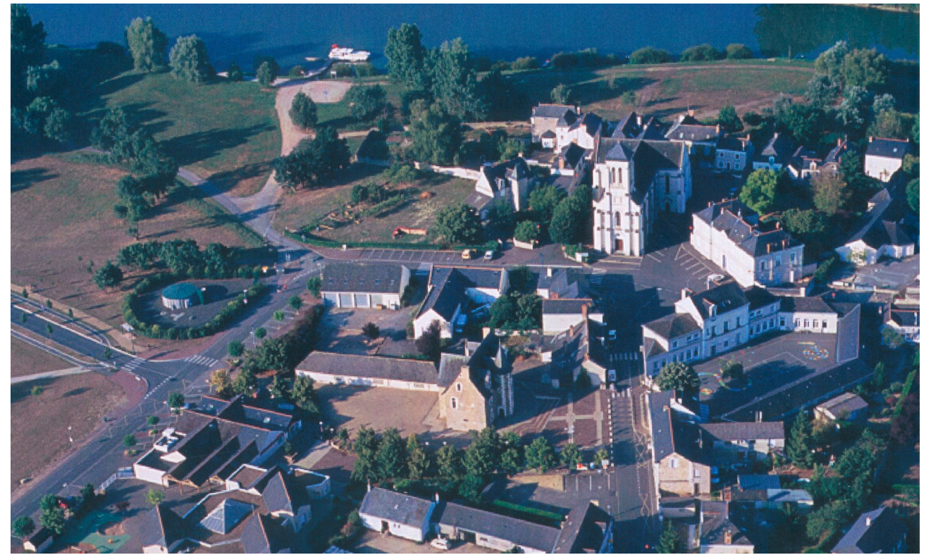
the town in the middle XX e century