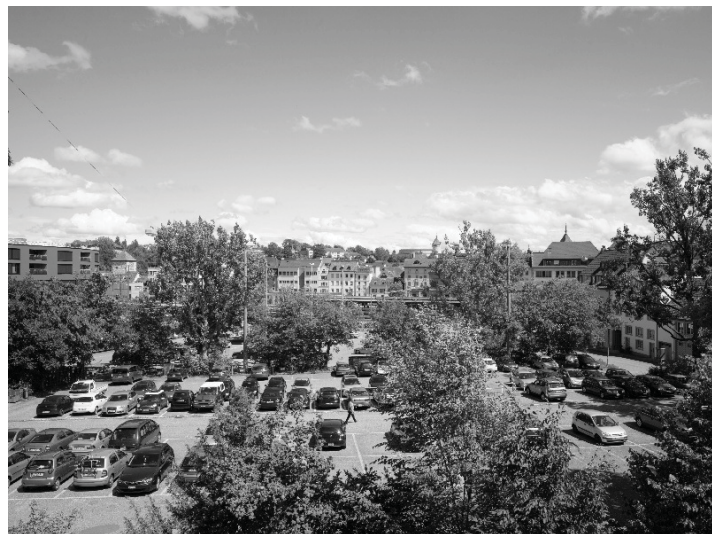
view from vocational school before intervention