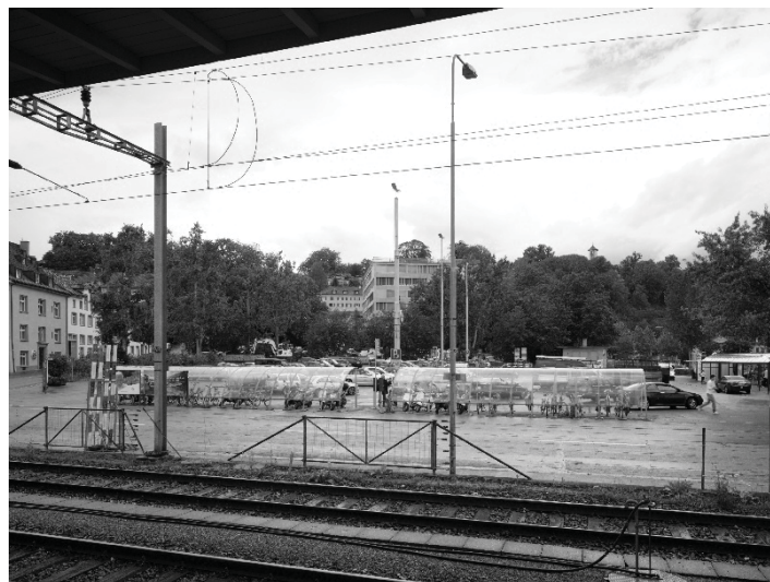
view from trainstation before intervention