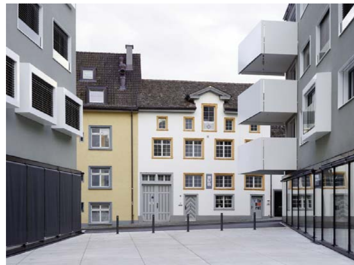
side views link with the consisting structure