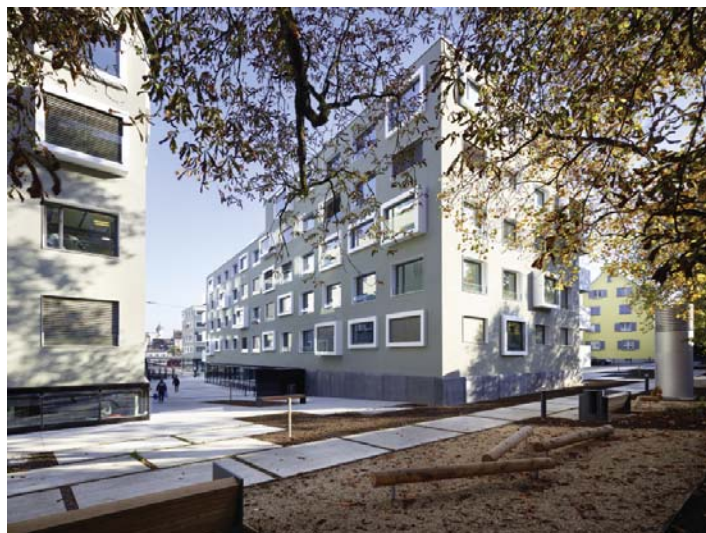
view from green belt towards historic center