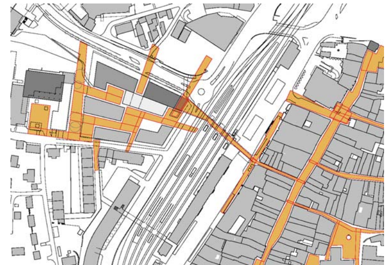
sketch analysis structure of public space (2007)