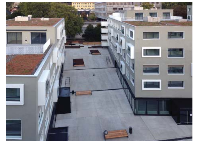
space between two living units