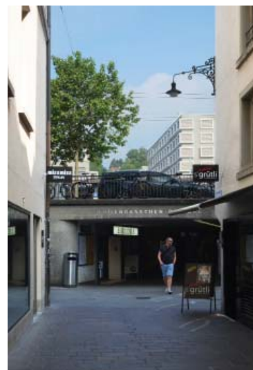
view from historic center