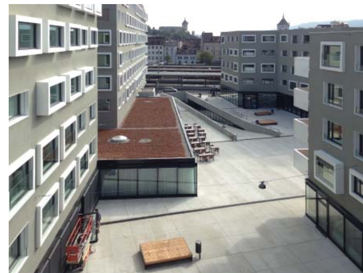
floating public spaces