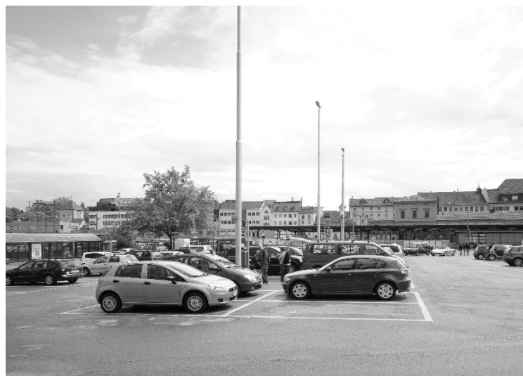
view towards historic center before intervention