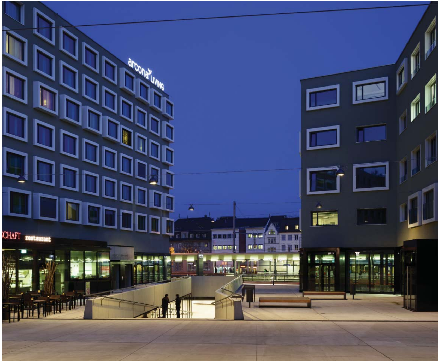
view towards historic center after intervention