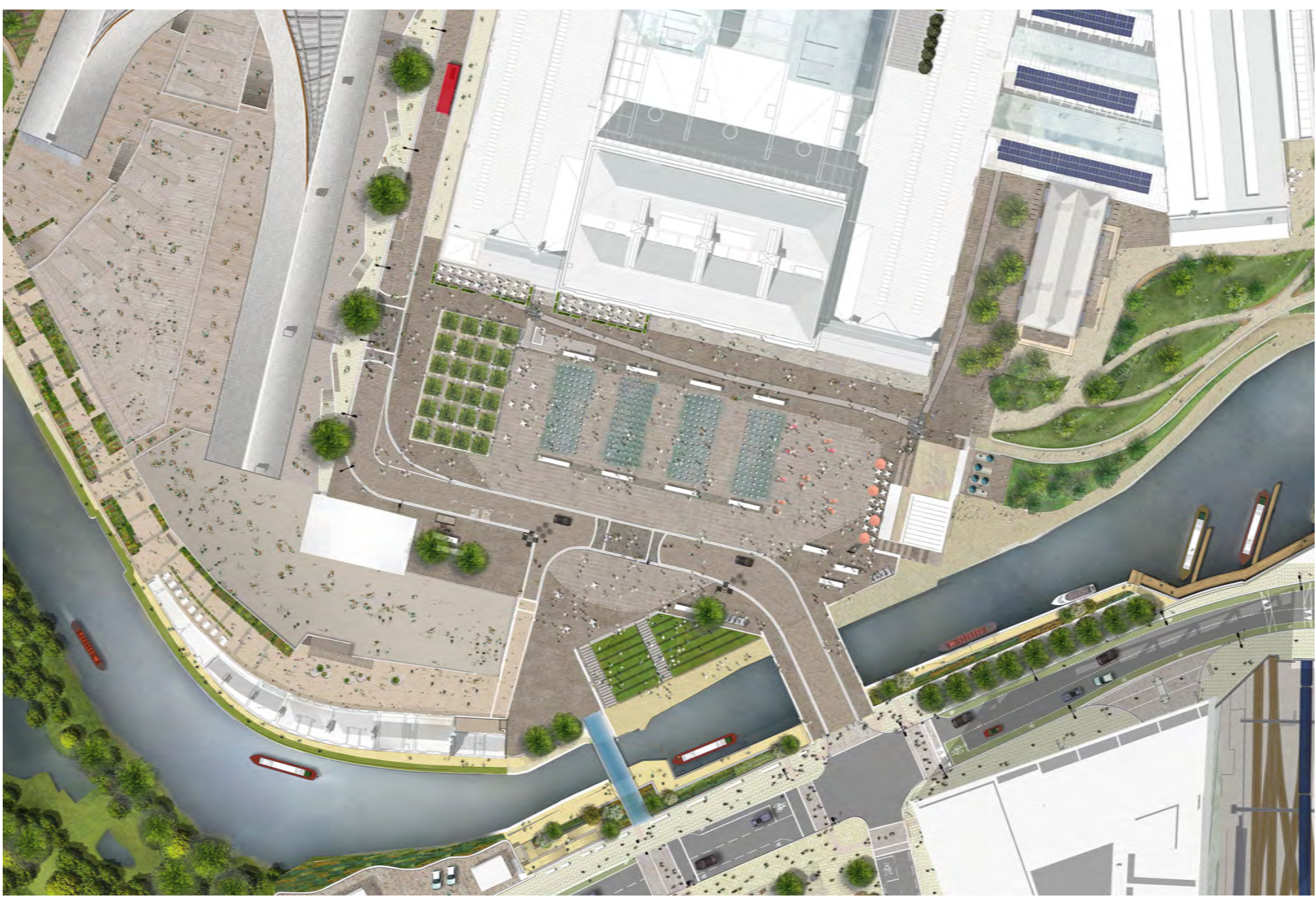
Master Plan of Granary Square

Lewis Cubitt painting of the Granary Building circa 1852