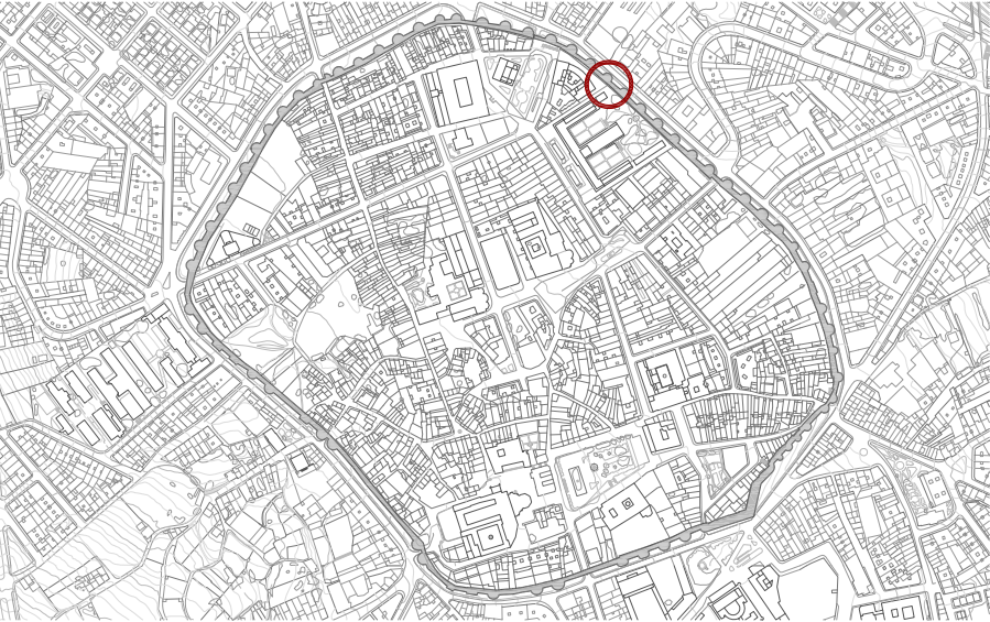
LOCATION PLAN 1:5000

The Roman Walls of Lugo, built between the late third century and early fourth century A.D, is the only complete roman fortification that is preserved in the world, and therefore, one of the most important monuments of the Iberian Peninsula. The Roman Wall and the Historic Center of the walled enclosure have the highest level of patrimonial protection in Galicia and was declared in November 2000 a World Heritage Site by UNESCO. The plot of the intervention is located inside the walls, next to the entrance to the public gardens of the council building.