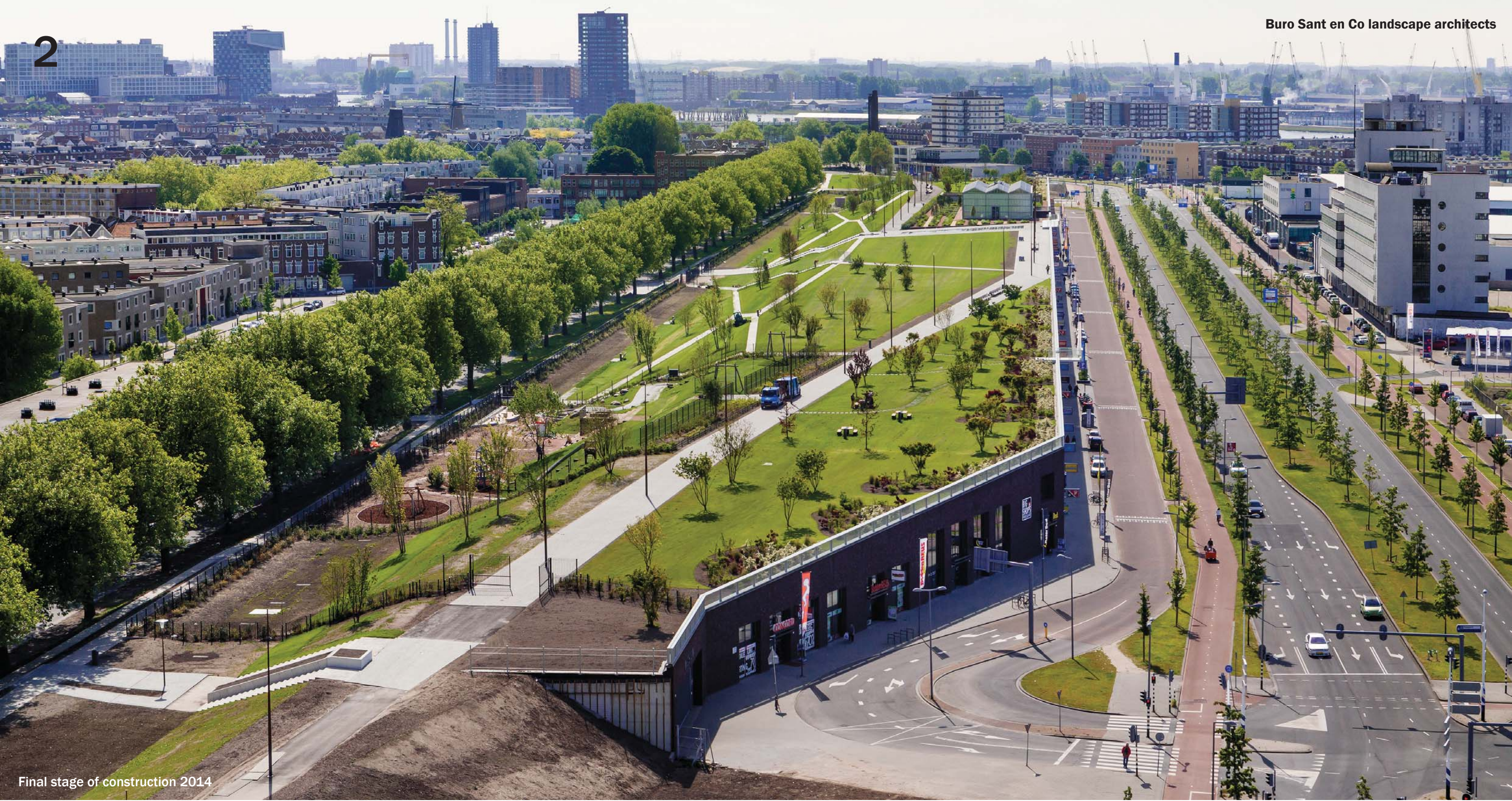
Final stage of construction 2014