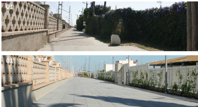
Condition before and after works

The paving and the different public services were in poor condition and the overgrown vegetation from the buildings' fences invaded almost the entire promenade.