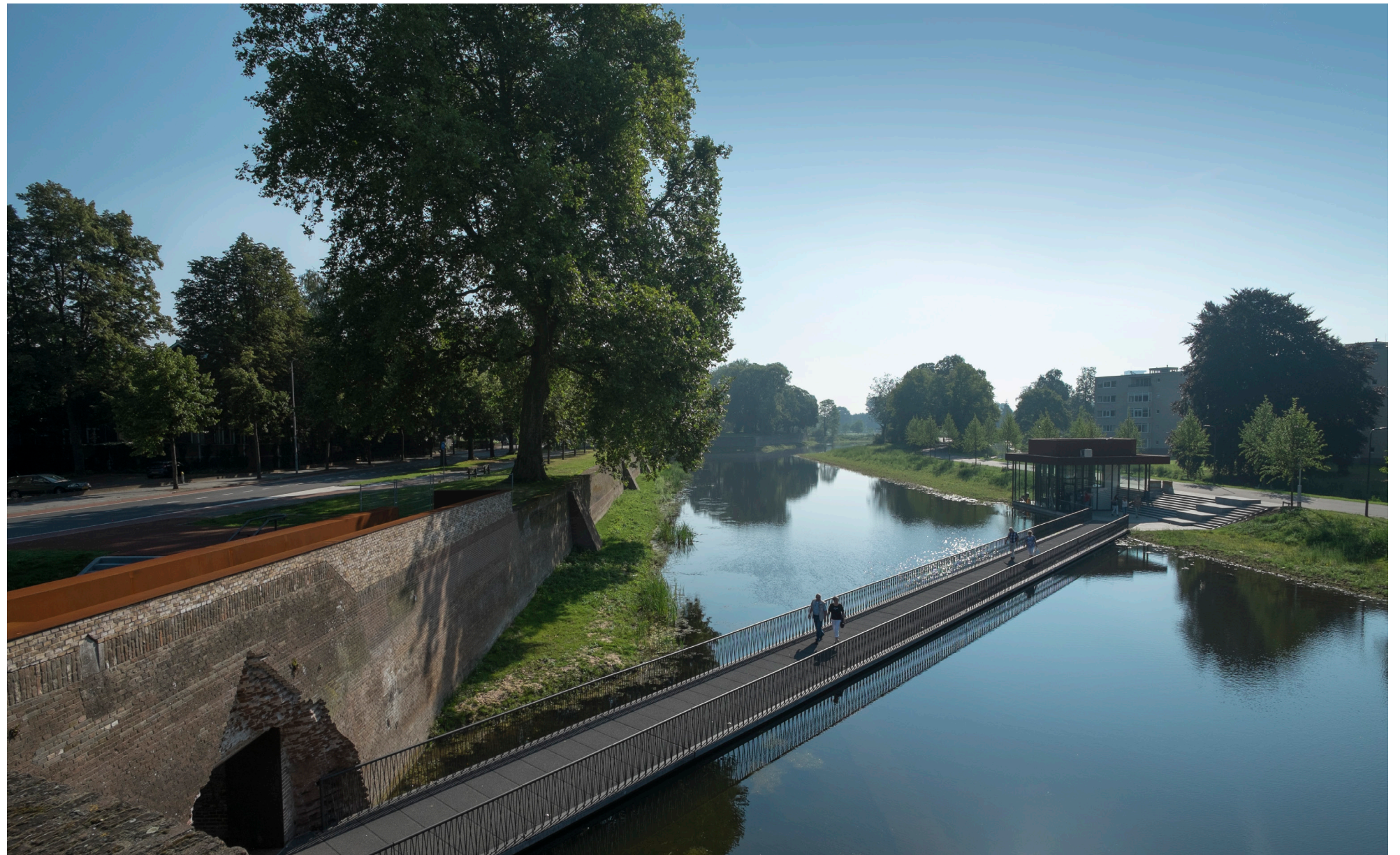
When exiting the underground parking garage, one enters the city center on a footbridge over the water through the historical city wall

In the rampart zone of the historical innercity of 's-Hertogenbosch, where at that time was a large parking place, the Municipality of 's-Hertogenbosch had the ambition to bring back the former citycanal and to introduce an underground parking facility for some 1000 cars. The fortifications have been designated as being a municipal archaeological monument and in view of this, the Municipality of 's-Hertogenbosch wanted to preserve the visible portions of the wall and bulwarks, but also the areas within the field of fire which have traditionally been kept open. MTD landscape architects / urban planners was commissioned to draw up an image quality plan and design for the open space of the Zuiderpark, the rampart zone and the Casinotuin. To this end the choice was made for a comprehensive approach in the architecture, the public space and the works of art in the public space.