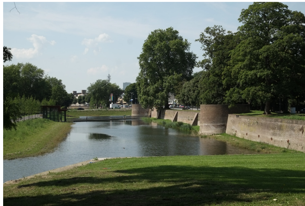
after: above ground