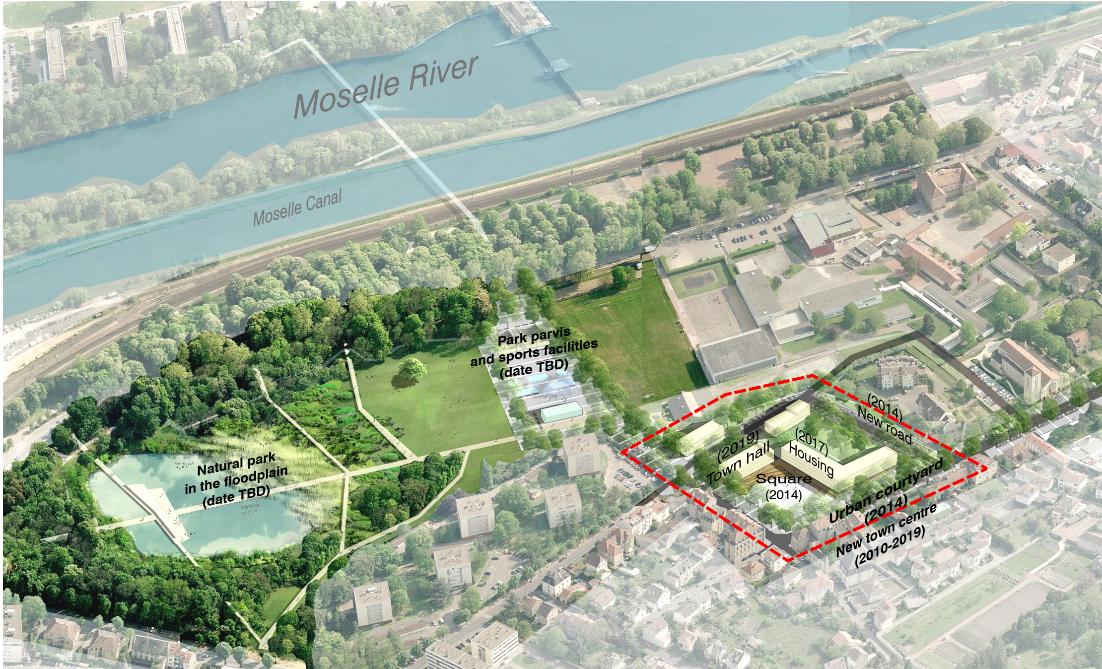
The urban restructuring project for the town centre: place de la Hottée de Pomme, the new neighbourhood including streets, new housing units, the new town hall, and the nature park.

The structure was erected in 2014, paving the way for the planned construction of housing (2017) and the new town hall (2019), to which it will provide access, already clearly marking the new centre of Ban-Saint-Martin