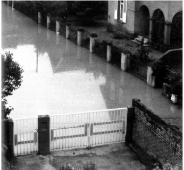
Flood of 1983 in Ban-Saint-Martin.