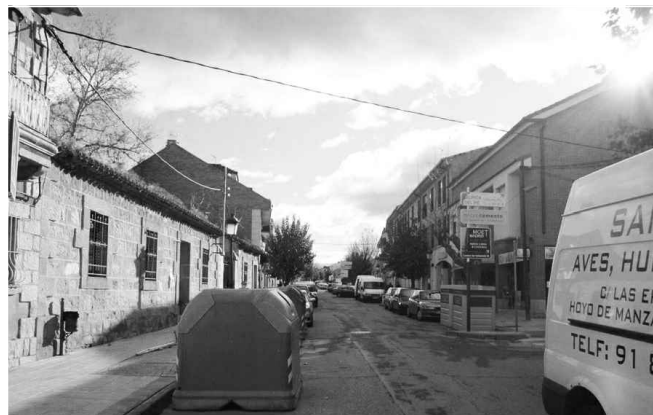
Main view of the street from Constitution square. Previous state above. Modified condition right.