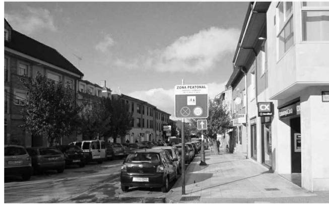
Main view of the street from Francisco Sicilia st. Previous state above. Modified condition right.

All of this with the purpose of revitalize the 'calle Real', improving the environment quality and helping citizens to bring changes to their communities and returning to them the importance that up to now the vehicles owned.