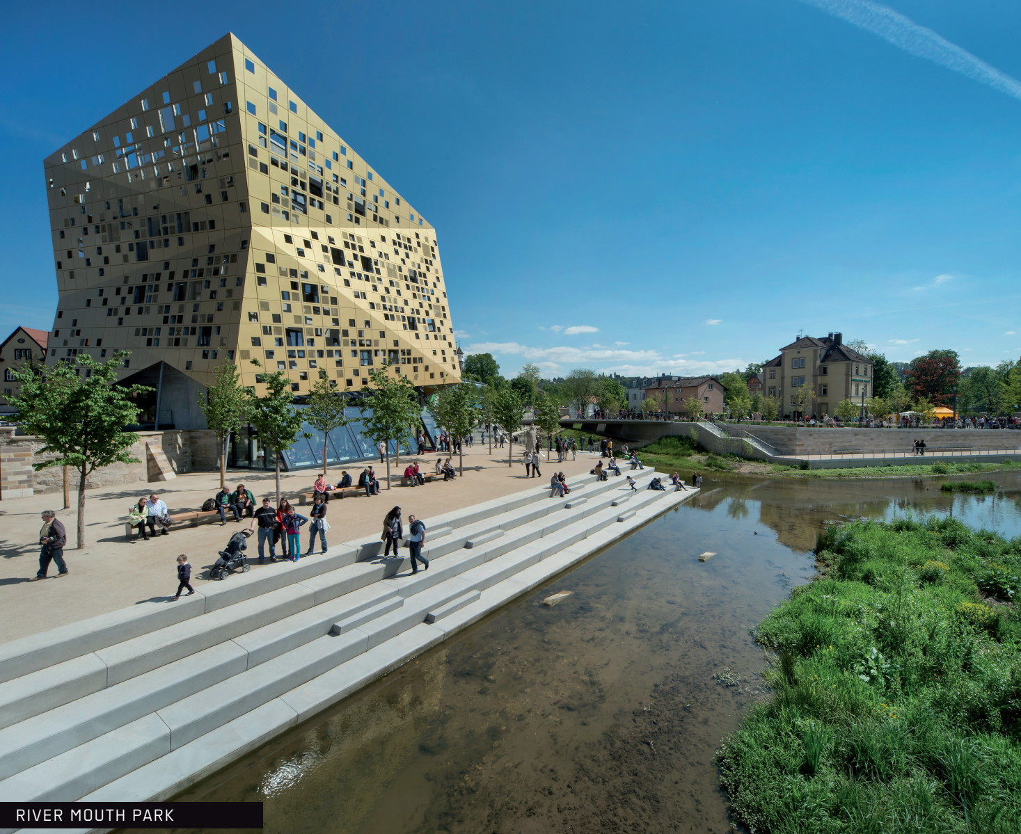
RIVER MOUTH PARK