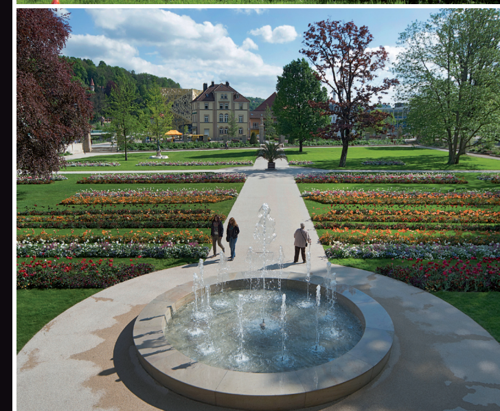
REDESIGNED BAROQUE CITY GARDEN