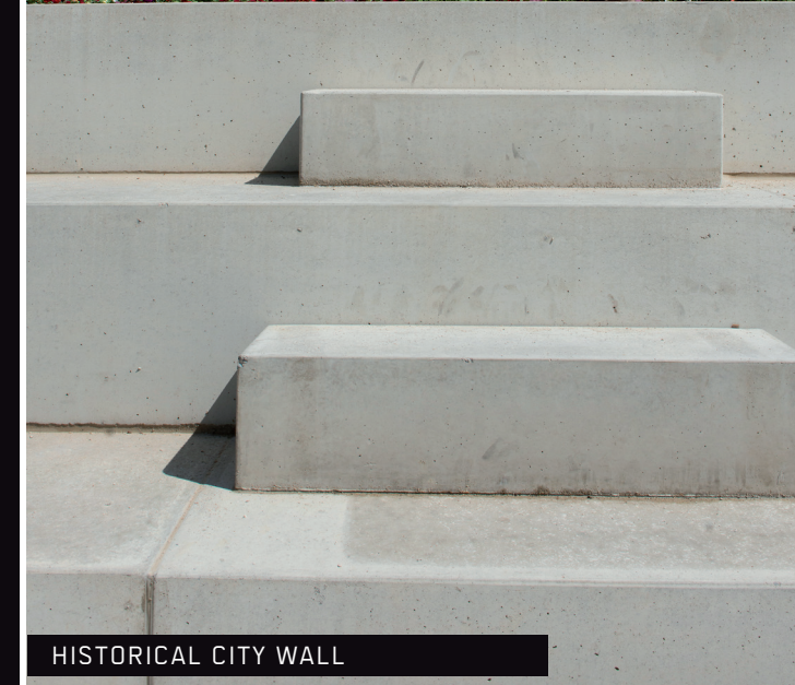
HISTORICAL CITY WALL