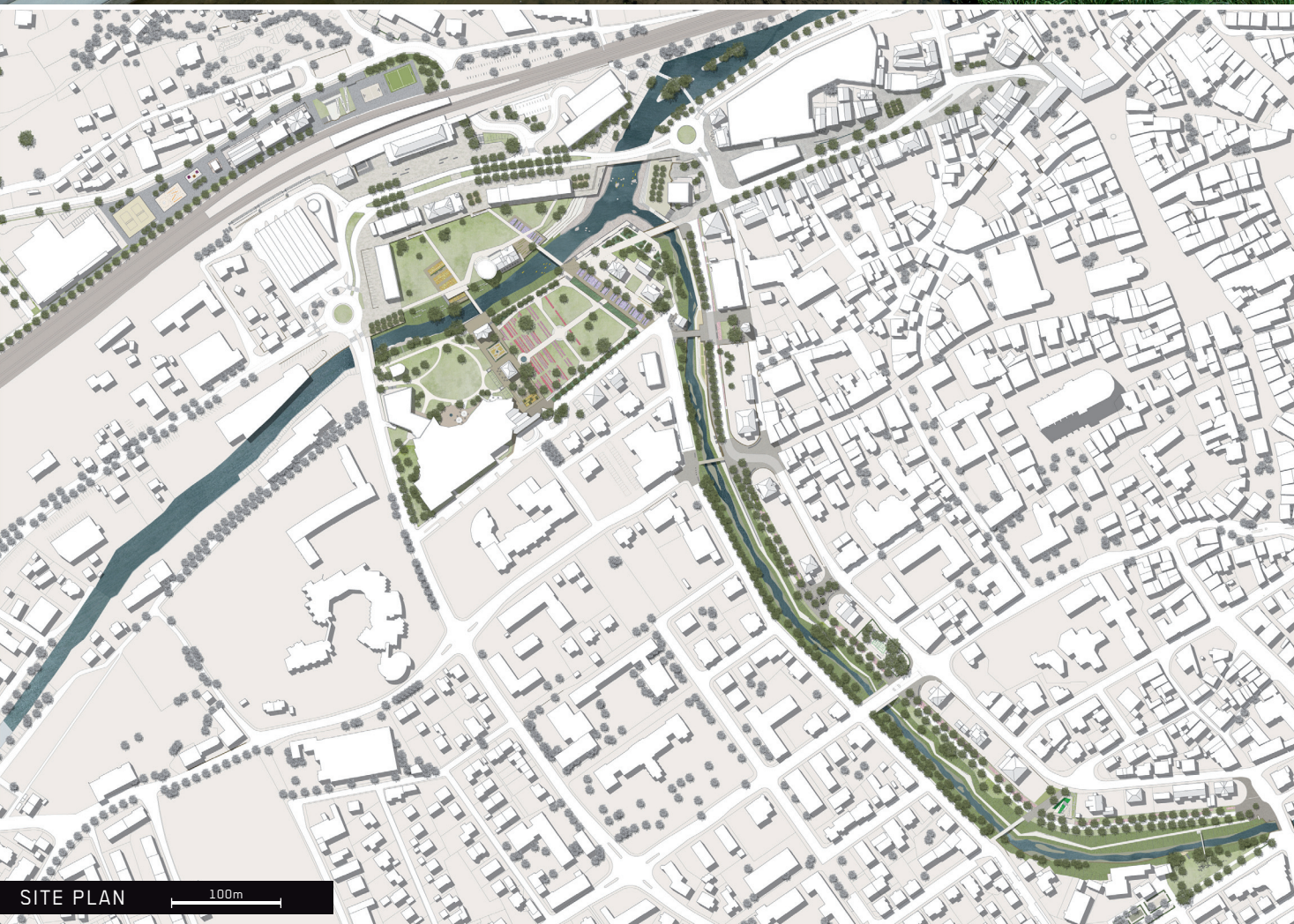
SITE PLAN 100m