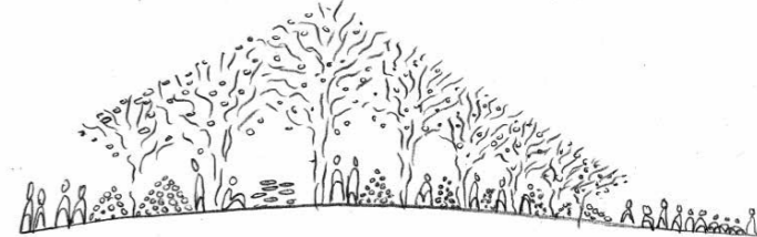
The Glowing Orchard

The design strategy diversifies the use of the Kingston Ancient Market Place for evening dining and performances, proposing perforate, cross-laminated timber market stalls that are transformed into lanterns at night. There are four distinct areas: the triangle of the Ancient Market Place, the circle of the Guildhall, the square of the All Saints' Churchyard, and the alleys from the Market to the River. The architectural language has grown out of the rhythm of the daily market, the gold of the Guildhall with the covered Hogsmill River, the peaceful garden of the churchyard held captive on three sides with the back of terrace buildings, and narrow alleys that lead to a vibrant riverside.