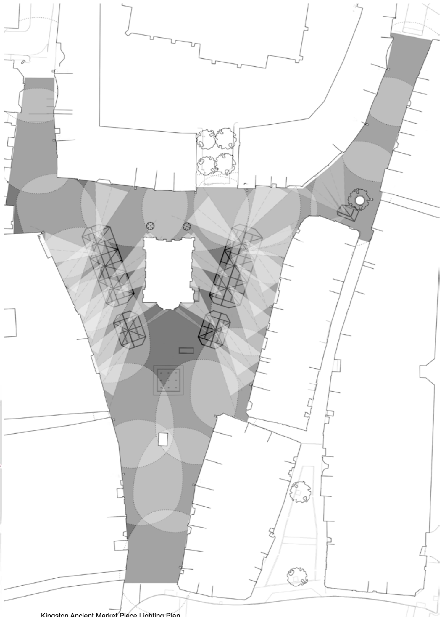
Kingston Ancient Market Place Lighting Plan