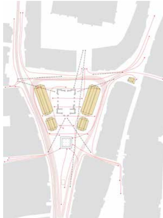
Kingston Ancient Market Place Flow and Vista