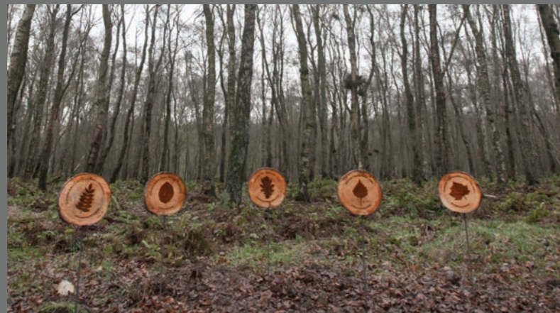
Above Station 1: 'Goona like to dress in birch leaves' 5 engraved timber disc featuring leaves of: Ash, Beech, Birch, Oak & Sycamore and explaining their mystical powers

In Scottish mythology woodlands are also inhabited by other creatures such as fairies, goona, hags and giants, trees and plants carry mythical powers. They can't be seen but traces and connections discovered.