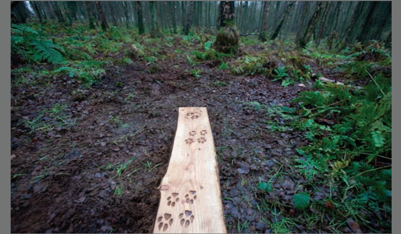
Above Station 5: 'Some leave tracks, others don't' 5 timber logs featuring footprints of: Roe deer, Red fox, Red squirrel, European rabbit, Wood mouse, Fairies, Goona & Giant