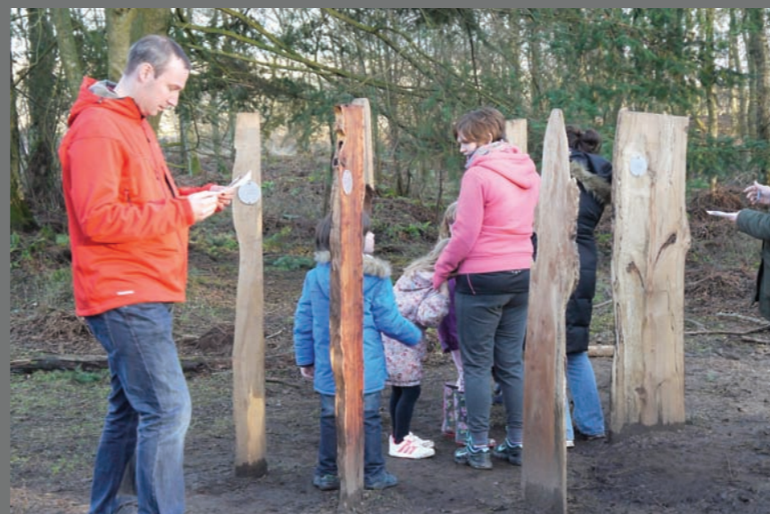
Station 3