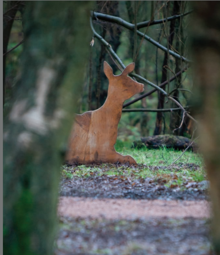
Above & left Station 4: 'Just like Hags, all woodland creatures have special powers' 5 timber animals featuring: Roe deer, Red fox, Red squirrel, European rabbit & Brown long-eared bat and explain their special powers