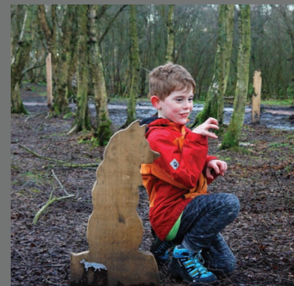
Station 4