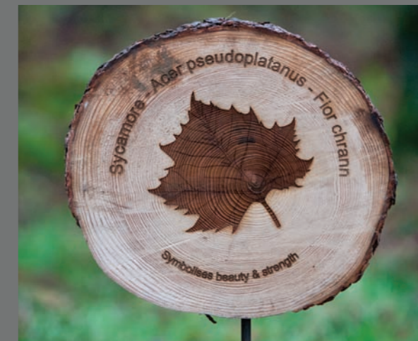
Station 1