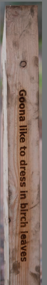
Station 1