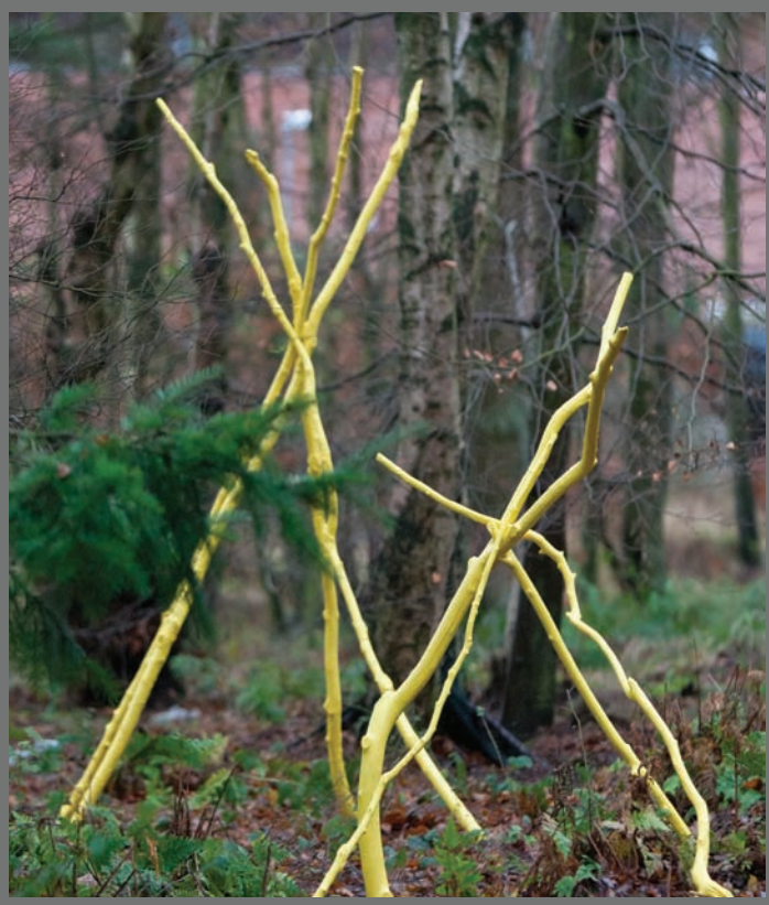
c) photo by Tina Norris

Calais Muir Woodland in Dunfermline (the former capital of Scotland) is a historic woodland at least 120 years old which used to be located 2.5km to the East of the town centre. It is 34 hectares in size and is one of the bigger woodlands in Fife Council ownership. Many historical features can be found here, such as the ruins of a Lime Kiln, a relic of nineteenth century industry. Over the last few decades Dunfermline has experienced a significant expansion to the East shifting Calais Muir Woodlands position from the edge to the heart of the newly established communities. Despite enormous investments (mainly from private developers) into the build environment, no such investment has taken place in appropriate greeninfrastructure. Calais Muir and the adjacent playing fields are the main greenspace for the new housing developments. Previously as an almost untouched woodland with a few pathways and boardwalks Calais Muir needed some investment to make the woodland accessible for bigger numbers of users, but also to educate it's visitors in order to protect the high quality of mature woodland. Retaining the character of the woodland as a 'wild', untouched woodland was critical.