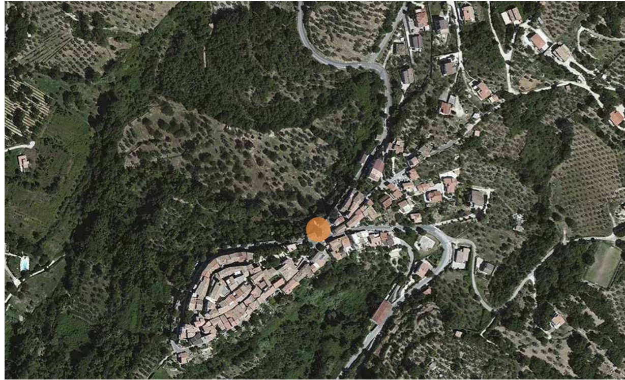
Photomap_Collelungo Sabino, Casapota, Italy

Situated in the historic landscape of Sabina Hills near Rome, Collelungo Sabino is a small Italian town still conserving its medieval settlements in a rural context. Whilst Italy is so famous for its piazzas - vibrant public spaces of communication - Collelungo Sabino's piazza could hardly be identified as one of those.