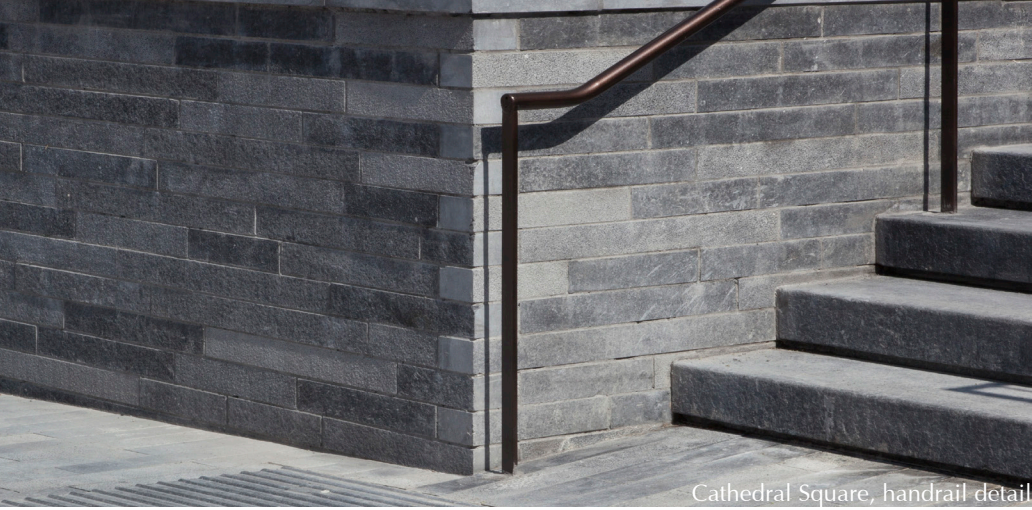
Cathedral Square, handrail detail