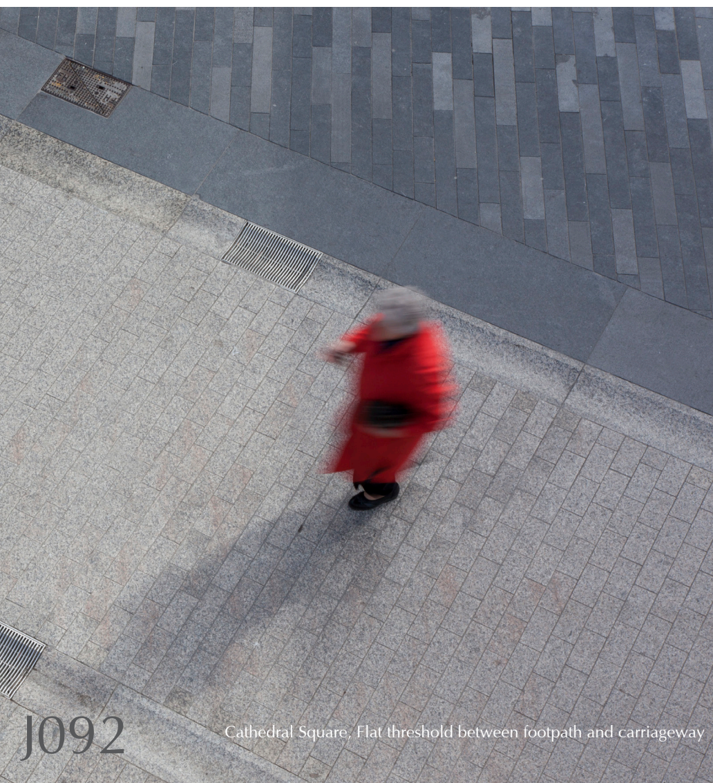
Cathedral Square, Flat threshold between footpath and carriageway