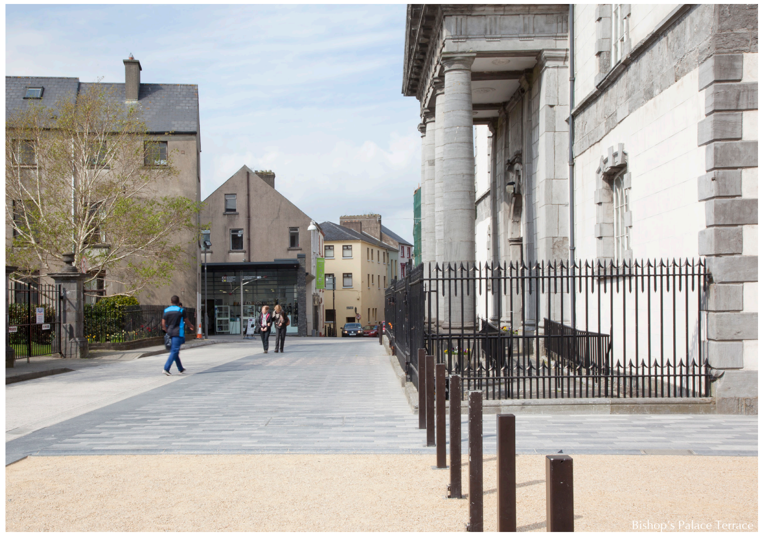
Bishop's Palace Terrace