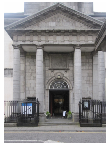
Bishop's Palace before intervention