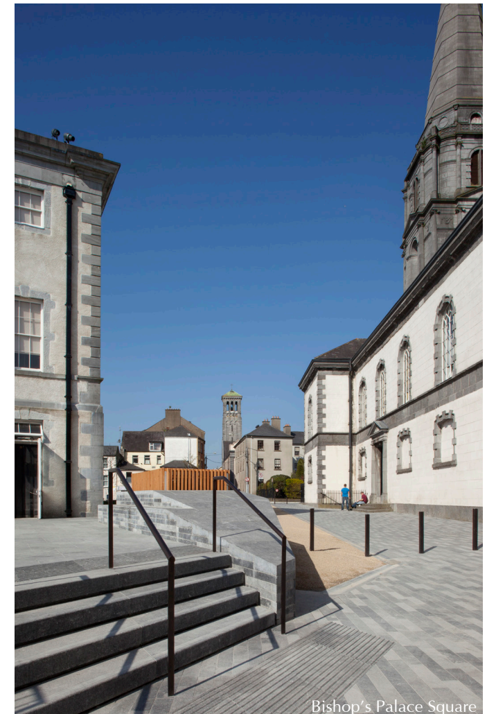
Bishop's Palace Square