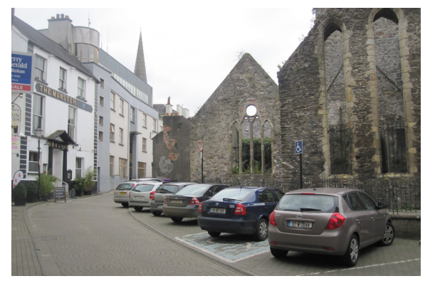
Friary Square, before intervention