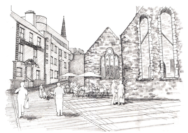
Friary Square, proposed intervention

By removing an existing plinth wall and railing to the south of the Franciscan Friary we make a generous area for street activities and events. This area is paved in large granite slabs, making a light-coloured surface against the walls of the Friary. Otherwise, one long granite bench is the only intervention made to the space.