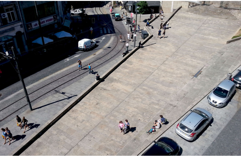
. A Batalha Square before . C Plan