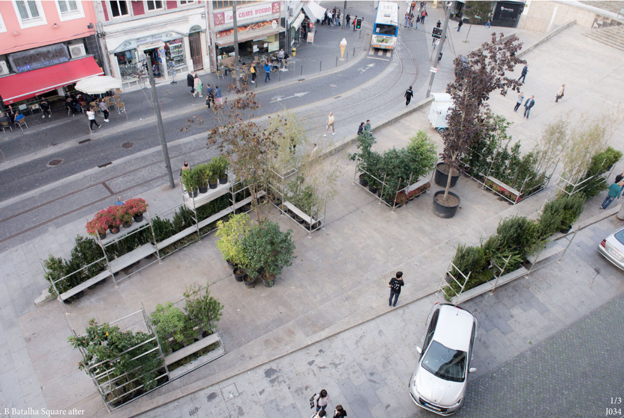
. B Batalha Square after

This installation intends to communicate to the city that public space is a privileged stage for social interaction and that, in order to keep ensuring it, considering its climate is growingly crucial.