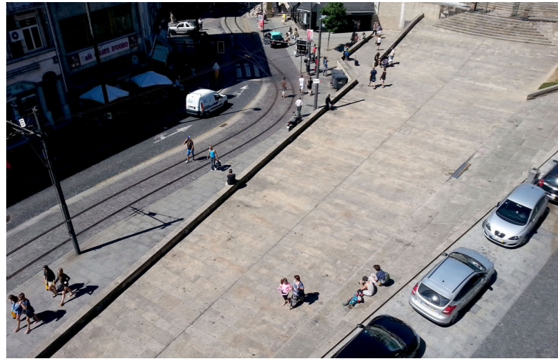
. A Batalha Square before . C Plan