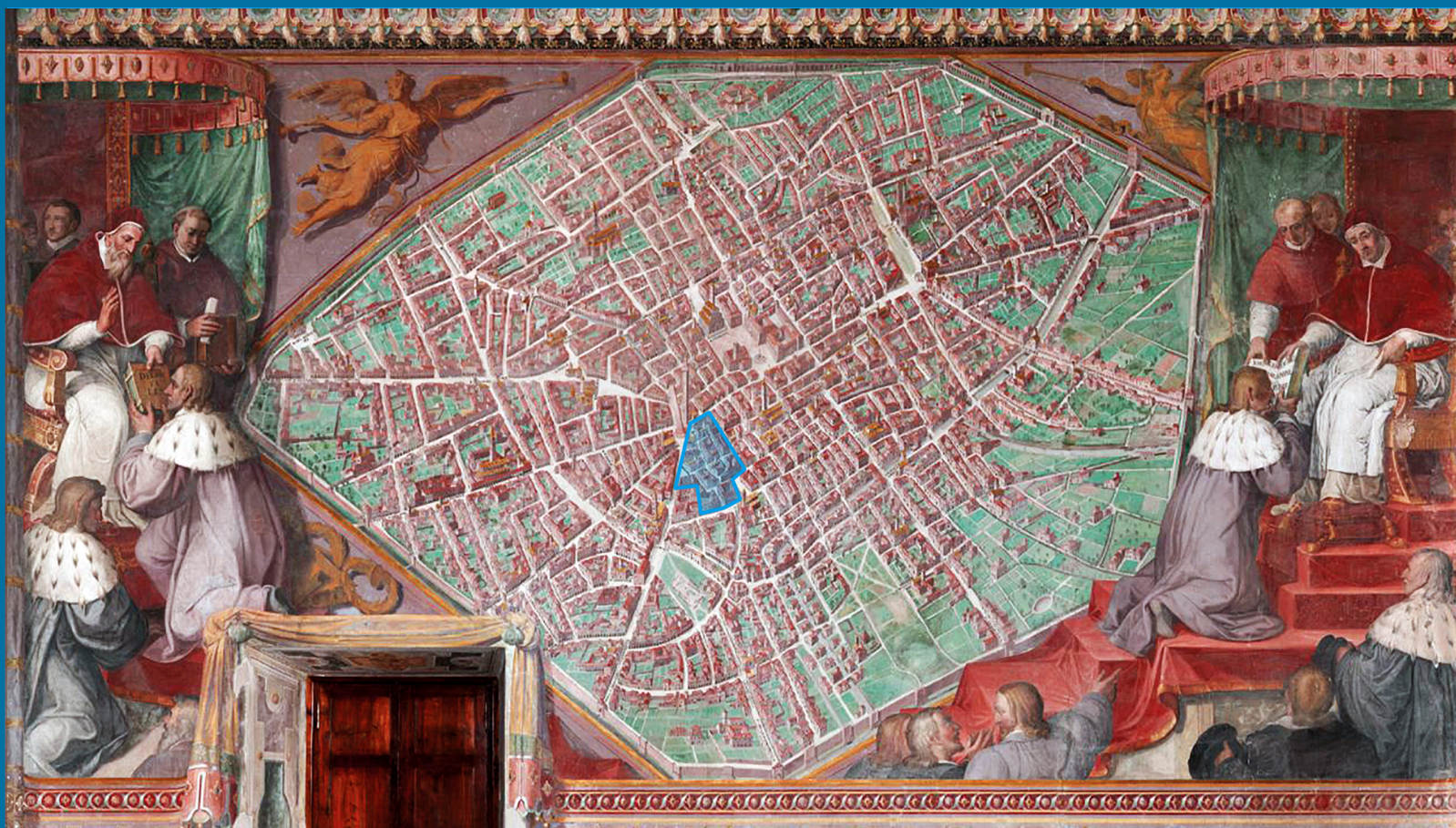
➔ MAP 1575 / SALA BOLOGNA/ VATICAN CITY _ THE URBAN FORM LOOKED LIKE TODAY