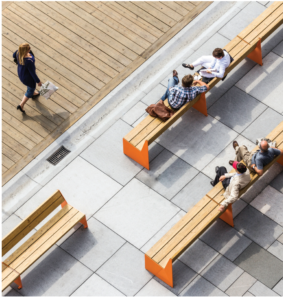
PHOTOGRAPH: PUBLIC SEATING. ▲

Aerial detail perspective showing placement of street furniture challenging traditional convention; focus on composition and spacing.