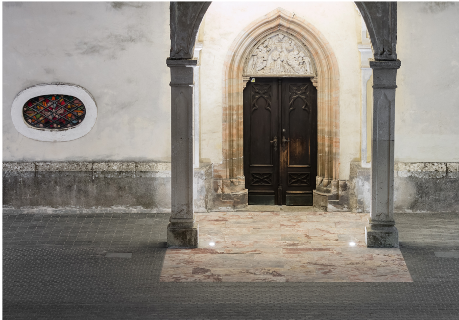
Entrance pavement of St. Jacobs Church