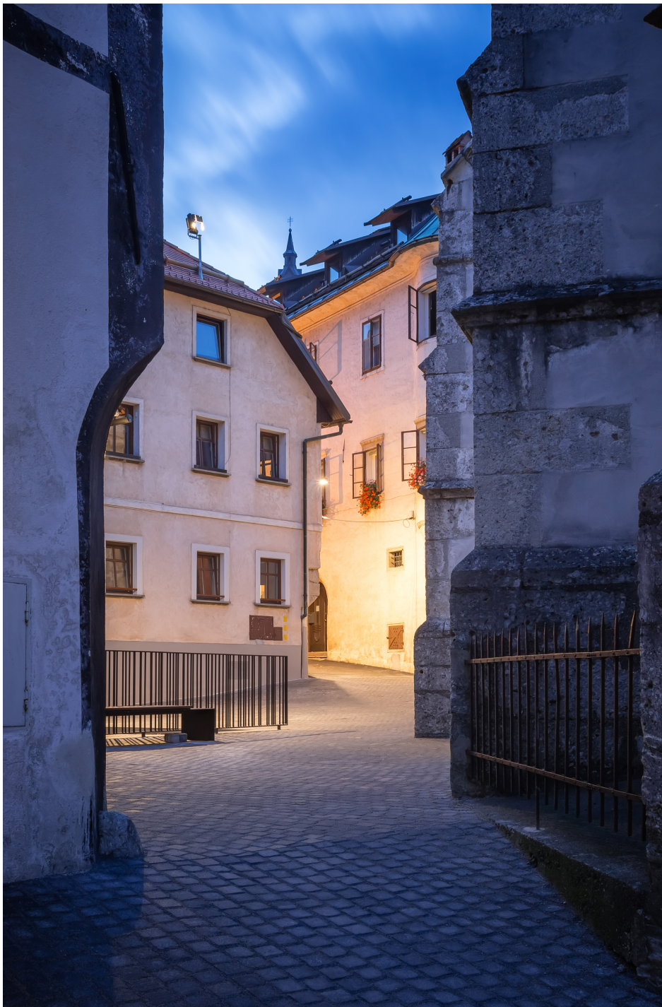
Passage behind St. Jacobs Church