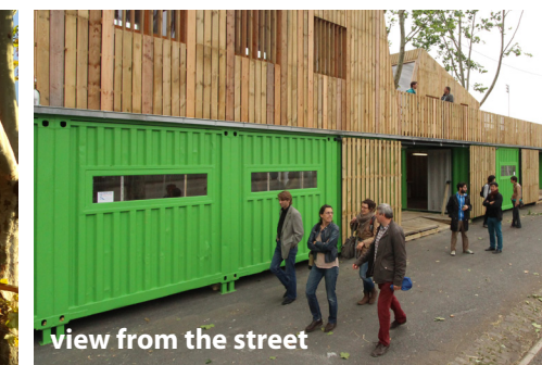
view from the street