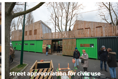
street appropriation for civic use