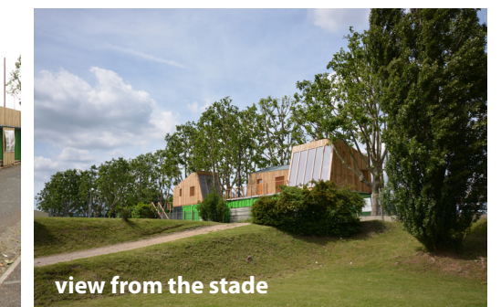
view from the stade