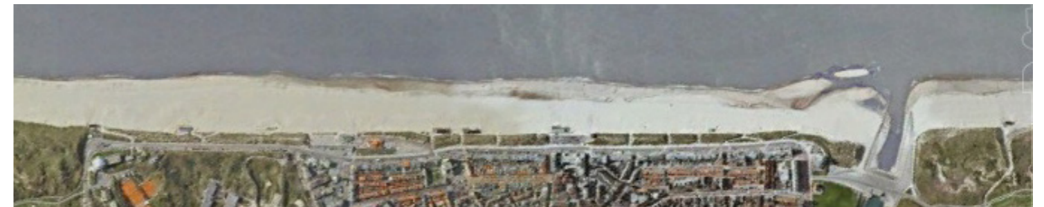
Topview of the coast of Katwijk before coastal defense project