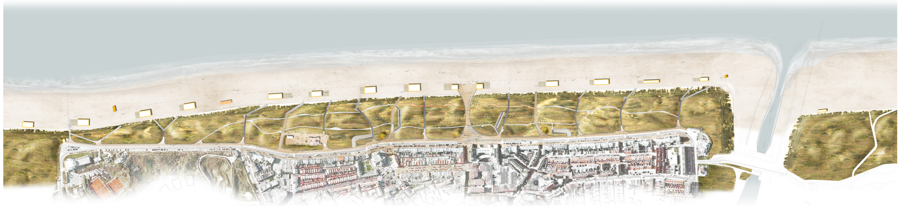
Topview of the coast of Katwijk coastal defense project