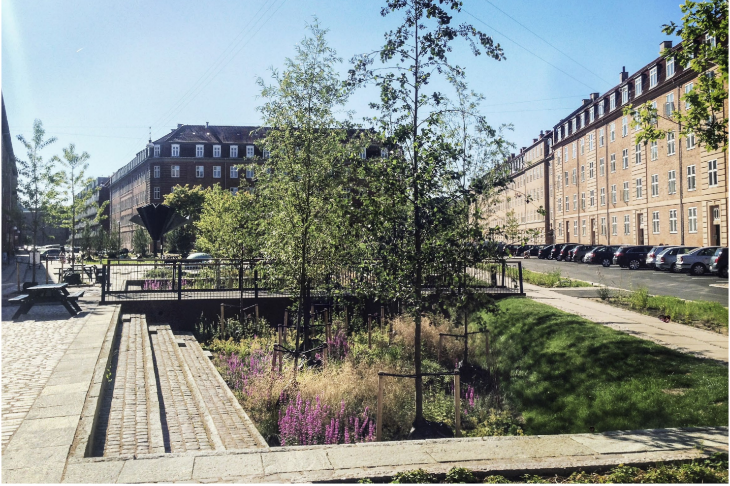
After the intervention the square is a lush "rainforest" that offer new urban qualities to the local area and its citizens by combining climate adaption with urban development.