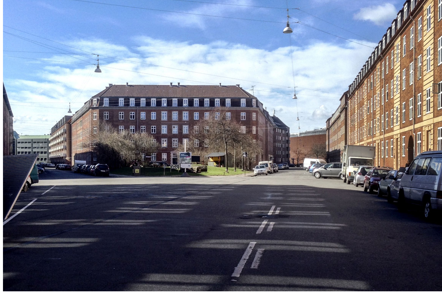
Before the intervention the square was paved with asphalt and dominated by parked cars while a small grassy area was used more as a dog toilet than as a park.