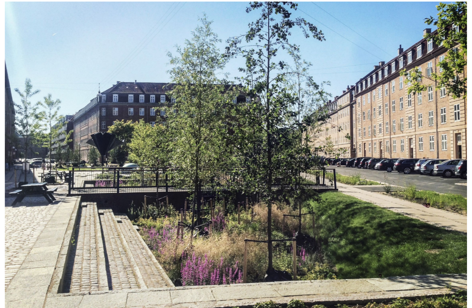
After the intervention the square is a lush "rainforest" that offer new urban qualities to the local area and its citizens by combining climate adaption with urban development.