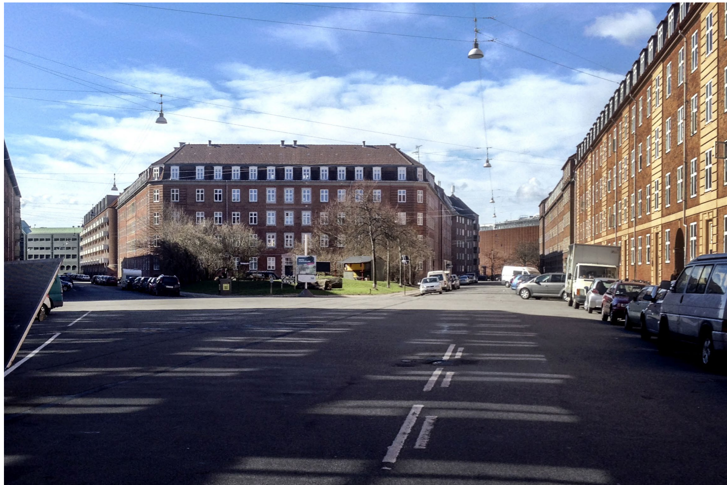
Before the intervention the square was paved with asphalt and dominated by parked cars while a small grassy area was used more as a dog toilet than as a park.

The dynamics of the new urban space is concentrated around controlling as much of the rain water as possible in order to manage its potential devastating force and at the same time taking advantage of its life giving powers in order to create a green urban environment. Using the law of gravity as guideline, a combination of underground water tanks, terrain-based waterbeds and other permeable surfaces, playful "water-sculptures" etc. make it up for the local handling of rain water.