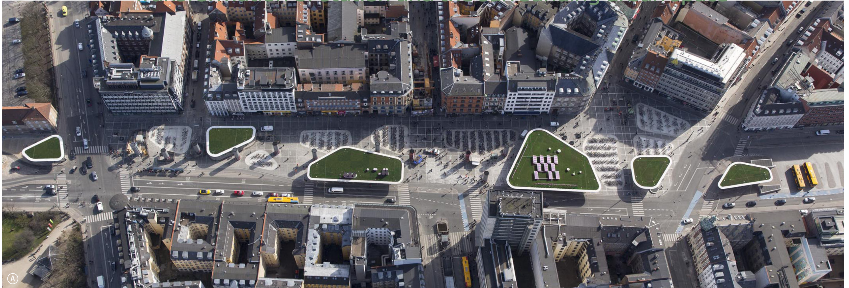
A - PHOTO: OLE MALLING & GOTTLIEB PALUDAN ARCHITECTS. B - PHOTO: JENS M. LINDHE & GOTTLIEB PALUDAN ARCHITECTS. C - NØRREPORT STATION BEFORE THE TRANSFORMATION

Transformation of station and the surrounding urban space