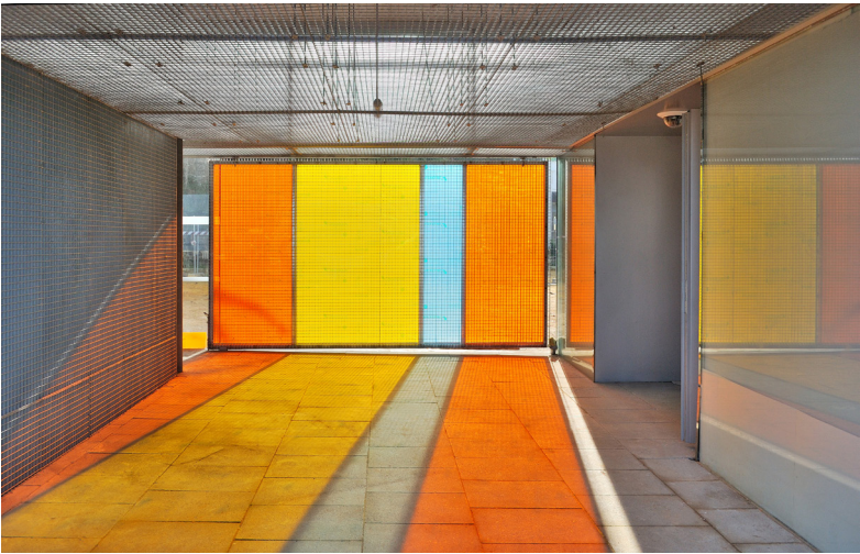
NEW ACCESS TO PARK