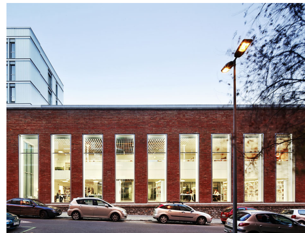
Guinardó Street facade.