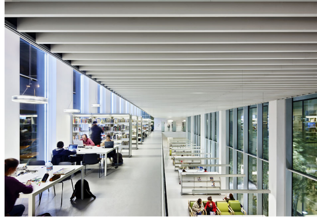
Library. Level 00-01.