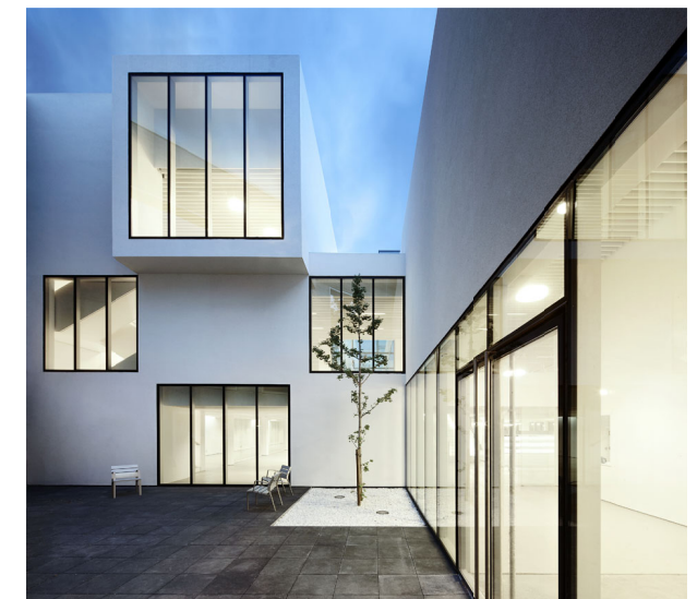
Library entrance patio.