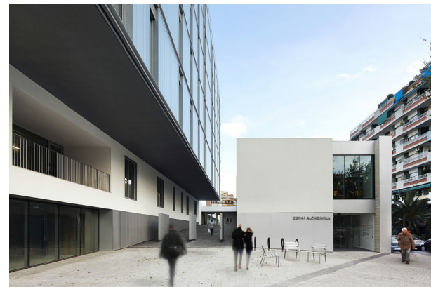
Upper corner. View of the ramped passage. Nursery school access.