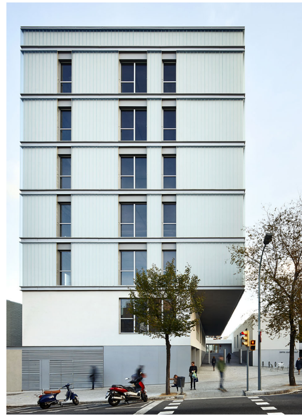
Upper corner. Residence, community center and nursery school access.