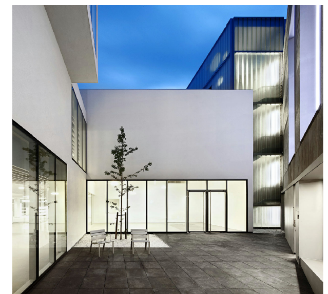
Library entrance patio.