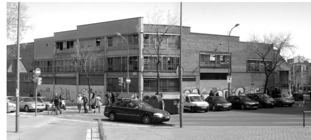
Upper corner. Facade not included in the original industrial complex. Previous state.