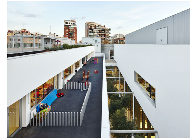
Nursery school. Level 02, roof playground and central patio.