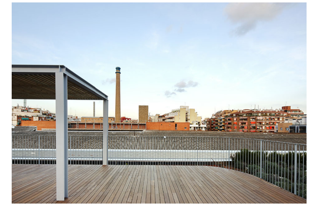
Residence sun terrace. Level 03, roof garden.