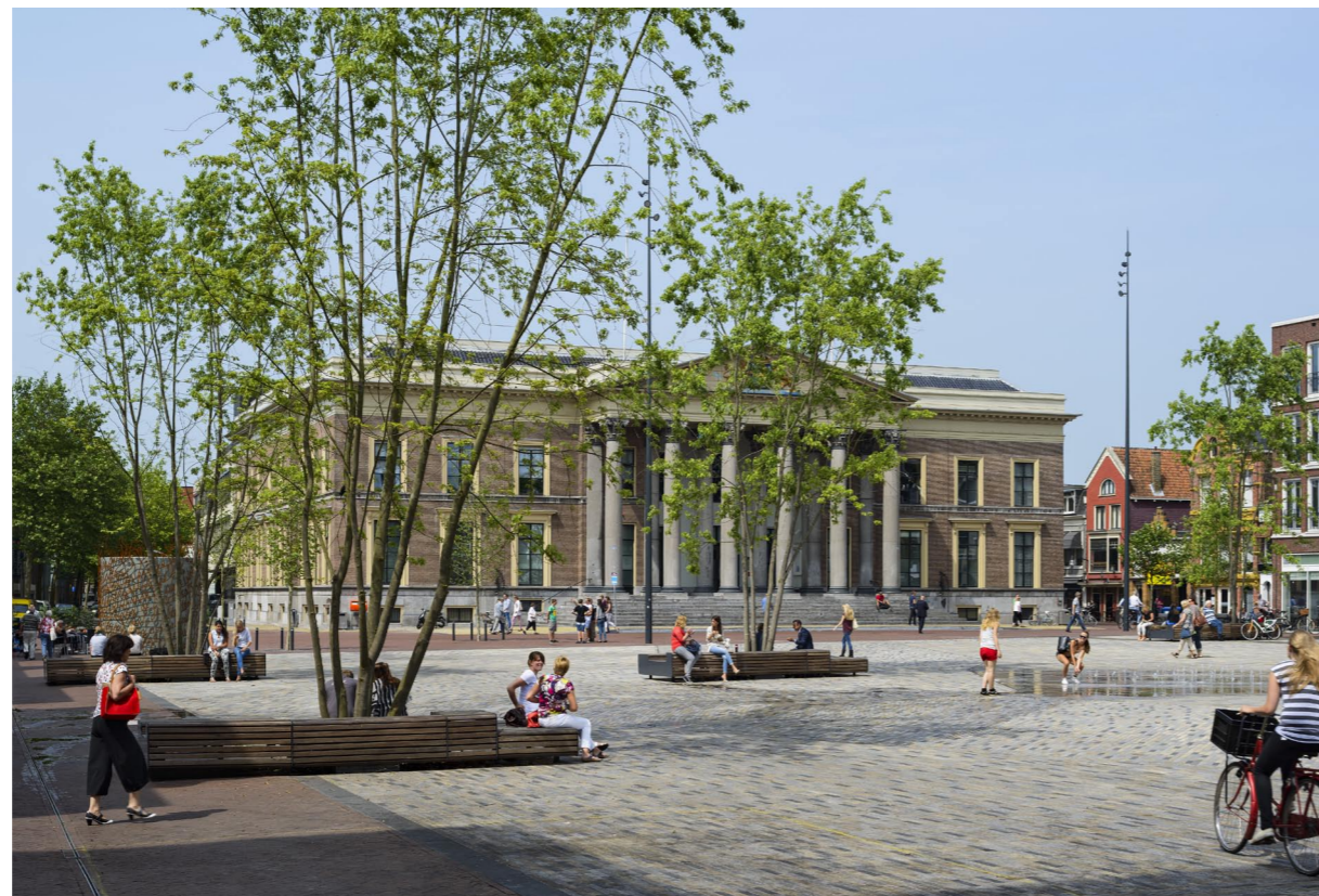
view towards the courthouse