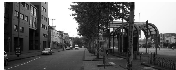
former situation view towards the courthouse