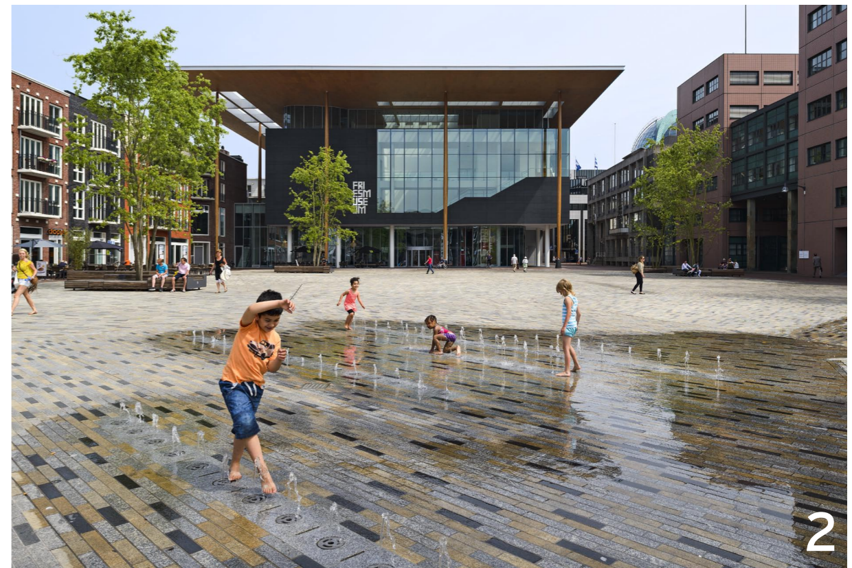
the waterfountains and new Frisian Museum