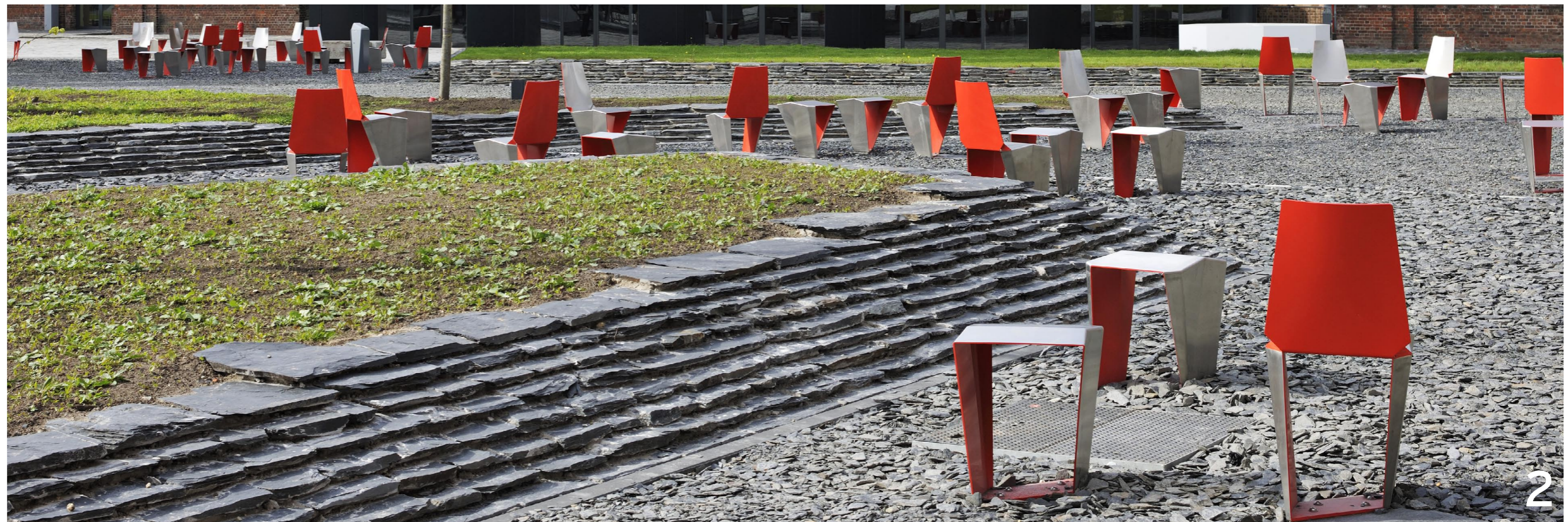
Belgian black slate, grass islands, new and old trees and scattered steel and red furniture