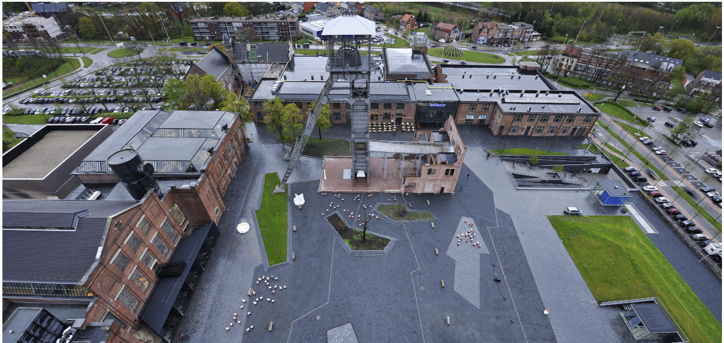
panoramic view from the tallest shaft tower