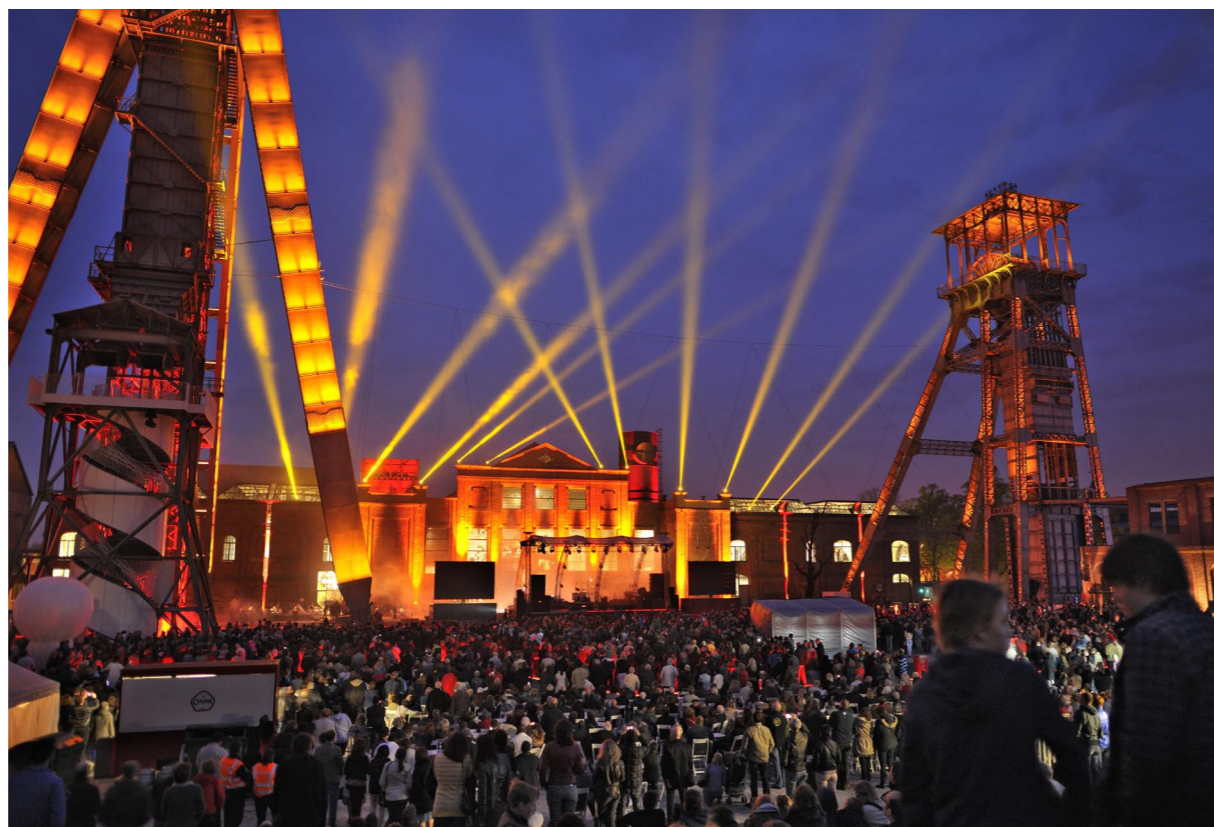
laser show on opening night